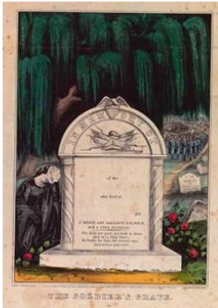
6. The Soldier's Grave, lithograph by Currier & Ives (1862).