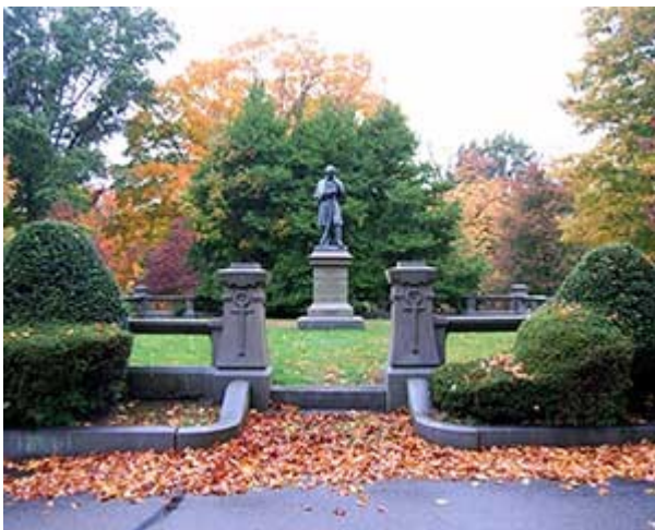
1. Martin Milmore, Roxbury Soldier Monument, Forest Hills Cemetery, Boston, Massachusetts, 1867.

These sentinels in bronze and granite, placed in town squares or garden cemeteries, linked local loss with the broader national implications of the Civil War.