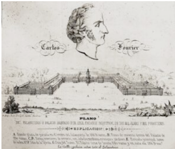
Figure 4: Fourier Phalanstere, Unknown author, public domain, via Wikimedia Commons .

In Fourier's phalanx, diversity, democracy, and difference were obligatory. Societal harmony relied on balancing various passions and embracing political, class, and personality differences. This embrace of difference attracted a cadre of reformers to the movement, including abolitionists, women's rights advocates, peace reformers, vegetarians, and socialists. From the 1840s to 1860s, Associationists founded dozens of phalanxes around the nation, including the popular Brook Farm community outside of Boston.