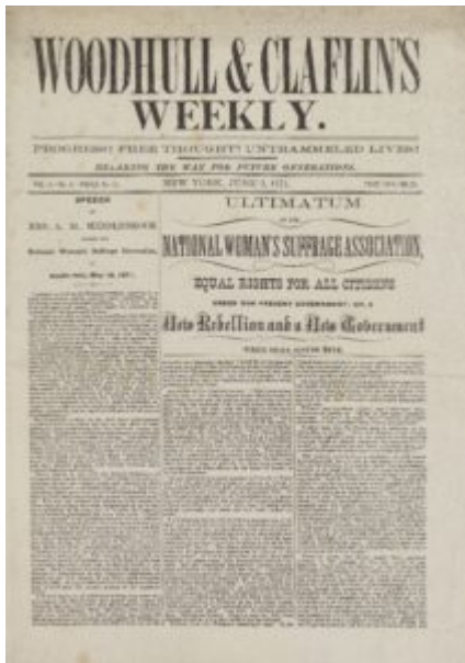
Figure 1: Front page from Woodhull & Claflin's Weekly, June 3, 1871, public domain