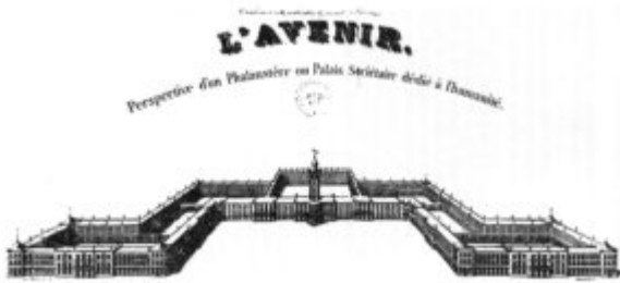
Figure 5: Perspective view of Charles Fourier’s Phalanstère. Victor Considérant, public domain, via Wikimedia Commons .

columns on “Reform Communities” to help readers join established communes and unite with other community-minded friends.