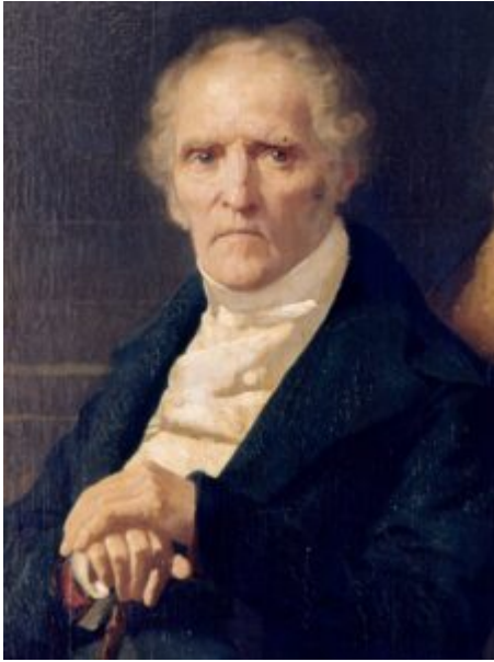
Figure 3: Portrait of Charles Fourier by Jean Gigoux, 1835. Jean Gigoux, CC BY-SA 4.0 , via Wikimedia Commons .

In Fourier's phalanx, diversity, democracy, and difference were obligatory. Societal harmony relied on balancing various passions and embracing political, class, and personality differences. This embrace of difference attracted a cadre of reformers to the movement, including abolitionists, women's rights advocates, peace reformers, vegetarians, and socialists. From the 1840s to 1860s, Associationists founded dozens of phalanxes around the nation, including the popular Brook Farm community outside of Boston.