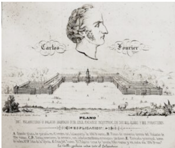
Figure 4: Fourier Phalanstere, Unknown author, public domain, via Wikimedia Commons .

In Fourier's phalanx, diversity, democracy, and difference were obligatory. Societal harmony relied on balancing various passions and embracing political, class, and personality differences. This embrace of difference attracted a cadre of reformers to the movement, including abolitionists, women's rights advocates, peace reformers, vegetarians, and socialists. From the 1840s to 1860s, Associationists founded dozens of phalanxes around the nation, including the popular Brook Farm community outside of Boston.