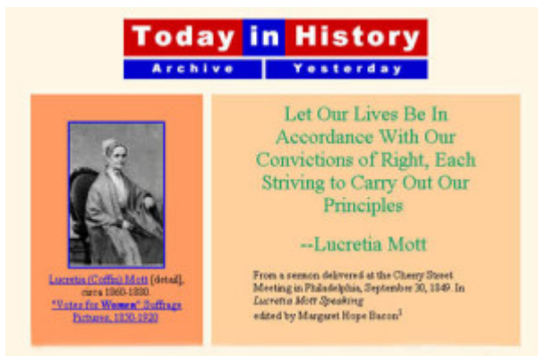
Fig. 4. A Today in History entry celebrates the birth on January 3, 1793, of

A user notes, correctly, that a paragraph in a Today in History feature for February 8 on Jules Verne refers incorrectly to Civil War "hot air balloons," since hydrogen gas, derived in a complex process described by the user, was used to fuel these balloons, not hot air. Another asks, would it be more accurate to say that Henry Wadsworth Longfellow was born in Portland, Massachusetts, on February 27, 1807, since Maine was not yet a state? Anne Hutchinson did not move to Long Island but to what is now Westchester County, a user writes, also noting today's Hutchinson River Parkway which passes near where she lived. Surely the sun does not "move north across the celestial equator," a user e-mails about a March 20 Today in History feature on the vernal equinox, but rather it appears to move. In another Today in History feature, two different Maryland residents catch an incorrect reference to Ellicot City as Endicott City.