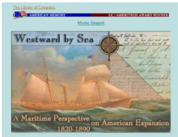
Fig. 2. Collection homepage of Westward by Sea: A Maritime Perspective on American Expansion, 1820-1890 . The collection from Mystic Seaport Maritime Museum and G. W. Blunt White Library in southeastern Connecticut presents pictorial and textual materials covering topics such as whaling life, shipping, native populations, the California Gold Rush, and immigrant experiences.

Papers are now completely online, and the James Madison and Andrew Jackson Papers will follow over the next several years. Other manuscript collections include the Samuel F. B. Morse Papers , the Alexander Graham Bell Family Papers , and the Frederick Douglass Papers . Large online book collections cover the regional history of the United States. Some collections were originally acquired through federal funding during the Great Depression, including American Life Histories: Manuscripts from the Federal Writers' Project, 1936-1940 , interviews and personal histories of ordinary people from twenty-three states, and Born in Slavery: Slave Narratives from the Federal Writers' Project, 1936-1938 comprising twenty-three hundred first-person accounts of slavery and hundreds of photos of former slaves, and more. Then there are the collections of contributing libraries, historical societies, and repositories, funded by a special program from 1996 through 1999. These include Westward by Sea: A Maritime Perspective on American Expansion, 1820-1890 , from the Mystic Seaport Museum and the G. W. Blunt White Library; The Church in the Southern Black Community, 1780-1925 from the University of North Carolina Chapel Hill; The First American West: The Ohio River Valley, 1750-1820 , and many more.