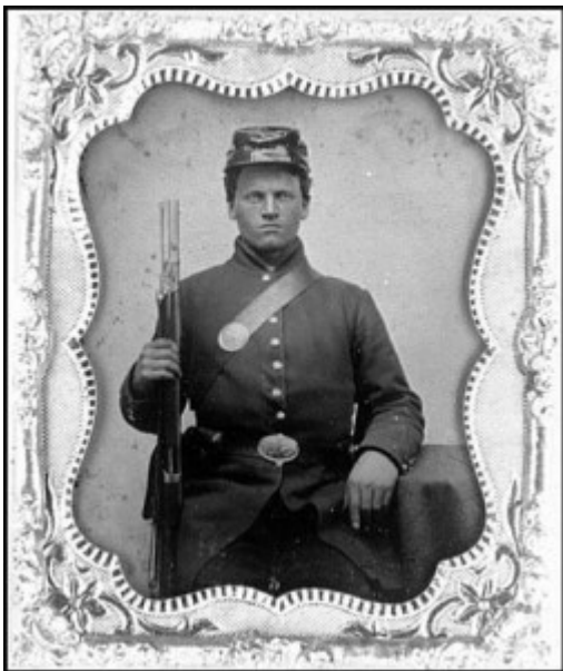
Fig. 3. From the collection, Selected Civil War Photographs, 1861-1865 . The supplied title in the bibliographical record for this portrait was changed in response to information provided by an online researcher.

Understandably, many corrections or additions to bibliographical information are for visual materials: daguerreotypes, photographs, and even film (especially those of early New York). For photographs, the primary source of information for cataloging these has been the original caption supplied by the creator or photographer on the item or in a caption logbook. But the majority of resulting corrections are actually made in a notes field of the bibliographical record displayed online with the item. This preserves the original caption, which is a primary source text itself. Identifying less notable people or places requires extensive research, and the necessary documentation is difficult to find. But now these are more widely available to users with knowledge of people and places. They will sometimes offer documentation, or if not, Library staff now have a name or other detailed information that can be specifically researched. If the outcome is ambiguous, the Library will sometimes add a note to the bibliographical description that there is conflicting information.