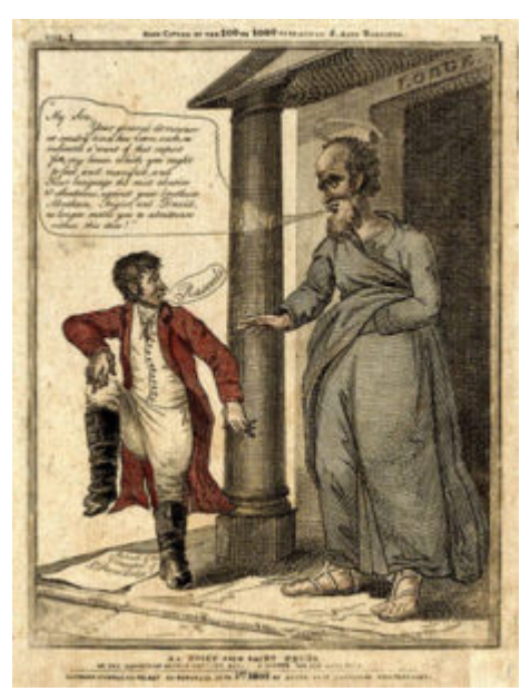
Fig 4. "An Edict from Saint Peter." Engraving by James Akin (20.5 x 15.5 cm), (1805).