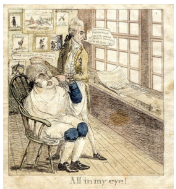
Fig 1. "All in my eye!" Engraving by James Akin (32.5 x 33 cm), (1806). Click to enlarge in new window.

Yet evidence suggests that if such prints were unusual, they were starting to come to the attention of a growing American consumer market. In cities such as New York and Philadelphia, printers began to issue small runs of caricatures, often similar in design and format to English satirical prints. These early American caricatures, usually unsigned, were often political in nature; anonymous artists attacked presidents, government representatives, and local politicians. And if they appealed to some buyers, they also generated a fair amount of suspicion. An opinion piece published in 1802 in the New-York Evening Post announced that, "It is with great pain we observe a species of libel has already appeared in our country in imitation of the abominable and licentious practice of the lower English, commonly called caricature, in which the unhappy object of abuse is exposed to vulgar derision... it is a species of attack equally cowardly and brutal." This was the market that Akin entered and helped transform in the early 1800s. He published both political and social caricatures and he prominently displayed his signature on impressions, taking full ownership of his visual attacks.