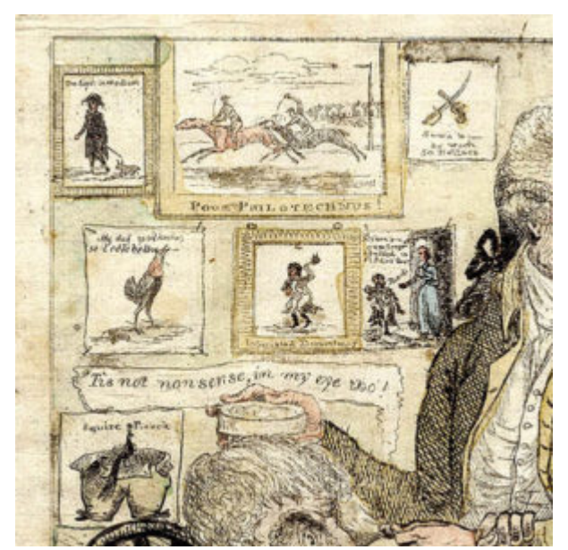
Fig 2. Detail from "All in my eye!" Engraving by James Akin (32.5 x 33 cm), (1806).

The other satirical print of Edmund Blunt is entitled "An Edict from Saint Peter" in which Blunt is shown being sent away from St. Peter's Lodge, where Freemasons met in Newburyport. Blunt was a freemason before resigning in 1802 for unknown reasons. This caricature is rare and does not appear to have been as widely circulated at "Infuriated Despondency." However, it most likely would have been seen in Newburyport, and the incident of Blunt's removal as a freemason and the circumstances surrounding such an event would have been the source of much gossip.