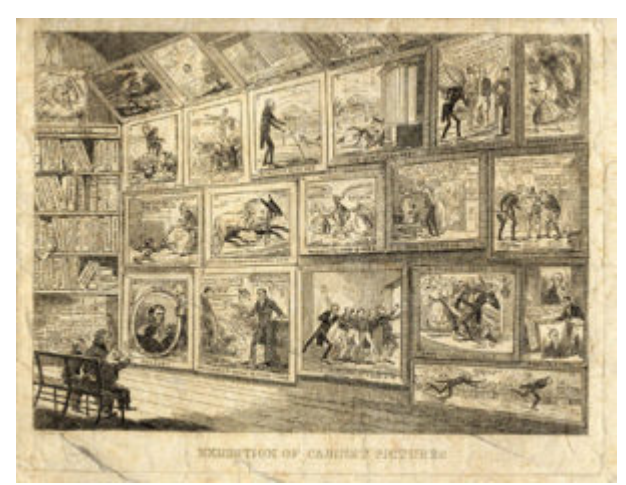
Fig 6. "Exhibition of Cabinet Pictures." Etching attributed to David Claypoole Johnston, (28 x 36.5 cm), (1831).