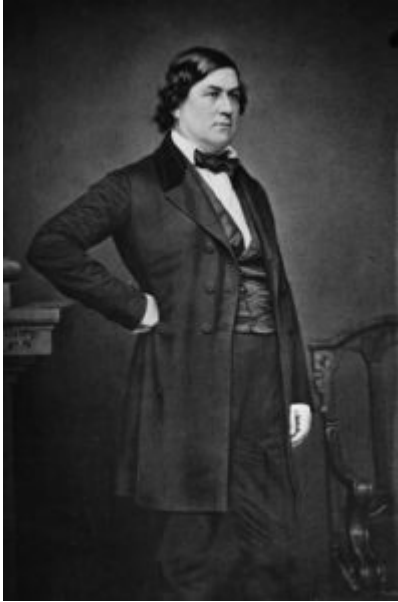
Fig. 1. "Robert Mercer Taliaferro Hunter, Secretary of State of the Confederate States Government (1861-1862)," photograph taken between 1861-1865.

As he talked on, it emerged that even this very earthbound Virginian—"he resembles some quiet unpretending farmer," wrote one journalist, "who might have come up from a rural district, to sit in a State legislature"—was capable of viewing minor American squabbles from the magnificent heights of global politics. The foundation of those politics, Hunter believed, was the inevitable expansion of "the Anglo-American population" all across the earth. "It is plain that in the course of this progress, ours must rule all inferior races." The fate of slavery in a specific western province, no matter how it was decided, could not dislodge this great fact.