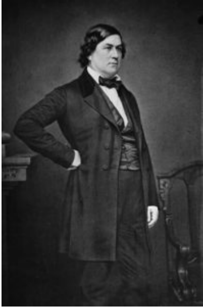
Fig. 1. "Robert Mercer Taliaferro Hunter, Secretary of State of the Confederate States Government (1861-1862)," photograph taken between 1861-1865.

As he talked on, it emerged that even this very earthbound Virginian—"he resembles some quiet unpretending farmer," wrote one journalist, "who might have come up from a rural district, to sit in a State legislature"—was capable of viewing minor American squabbles from the magnificent heights of global politics. The foundation of those politics, Hunter believed, was the inevitable expansion of "the Anglo-American population" all across the earth. "It is plain that in the course of this progress, ours must rule all inferior races." The fate of slavery in a specific western province, no matter how it was decided, could not dislodge this great fact.