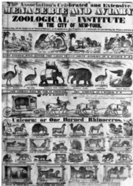
Figure 4. The broadside describes the Zoological Institute as “Embracing all the Subjects of Natural History.” Rhetorically equating “Natural History” with the mesmerizing abundance that follows in rows of images, the advertisement is also very cluttered; its individual details are hard to follow, images of the “extensive menagerie and aviary” distracting from any one entity, to say nothing of the circumstances under which the Institute gathered these subjects or otherwise treats them now. The Association’s Celebrated and Extensive Menagerie and Aviary From Their Zoological Institute in the City of New-York, Embracing All the Subjects of Natural History, as Exhibited at That Popular & Fashionable Resort During the Winter of 1834-5 ( New York: Jared W. Bell, 1835 ).

turbulent realities” surrounding them. Writing over this reality, in a purported attempt to account for everything, natural history becomes a cluttered “stage” that covers over the coerced labor of those who make such excursions and extractions possible. The genre, in fact, comes to crowd out the world as it really is. (Figure 4)