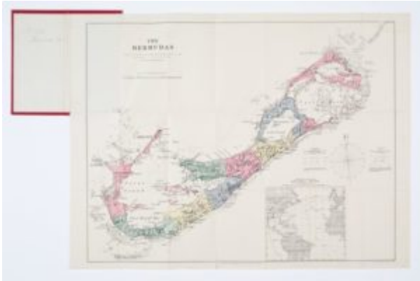
Figure 6. This map of Bermuda shows the local districts as they would have been drawn by British colonial powers when Prince was born around 1800. In her narrative, she identifies “Brackish-Pond” as her birthplace. A “Brackish Pt.” and “Brackish Pt. Dock” are listed on this map in the Pembroke and Devonshire districts, respectively, which appear at about the midpoint of the depicted island. The Bermudas. Prepared at Stanford's Geographical Establishment, London for Gregory V. Lee, Hamilton, Bermuda, ca. 1892.