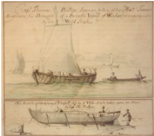
Figure 5. Two sketches of an intermediate craft similar to those used from ship to shore by European and African slave traders on the Atlantic coasts of Africa and the Americas. Captain Thomas Phillips, Public domain, via Wikimedia Commons .

an expansion and mutation of the same financial accounting it purportedly strove to undo. If not in intent, then in consequence, in promising to reduce mortality rates among enslaved peoples, the Slave Trade Act ultimately made it possible to reduce the margin of error insurers calculated, to stabilize valuation, and to make the industry's accounting more predictable and the industry more profitable.