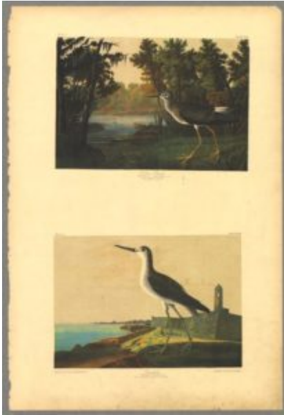
Figure 3. Two sketches of birds possibly from the scientific genus Tringa . While natural historical sketches such as these strive for detailed replication of their subjects, precision can become overrepresentation, as the scenes ultimately show inaccurately large birds. This kind of proportionality is inherently political as, in the second sketch, the posing subject obscures the Castillo de San Marcos in the background, a defensive fort that stands as an unambiguous symbol of settler colonialism. Julius Bien, Greenshank, Totanus Glottis, Temin, View of St. Augustine & Spanish Fort East Florida (New York: s.n., 1860).