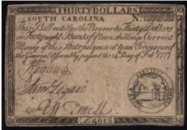
Fig. 2.

As we might expect, paper money cuts a very different figure in the literary efforts of its supporters. Advocates of paper money did not deny its risks, but they also saw it as a resource that could expand the money supply and, in so doing, facilitate exchange and stimulate enterprise. In their writings, the character Paper Money is still a man lacking in “substance,” but his insubstantiality takes on a decidedly positive spin.