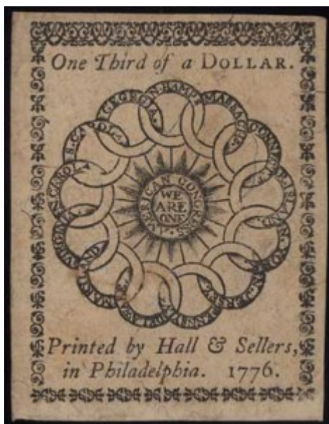
Fig. 4.

That Paper Money, as living hero and martyr, was often a national liberator was amply reinforced by the rhetoric of bills themselves. The 1775 "Sword in Hand" bill (fig.1), engraved by Paul Revere and issued by Massachusetts at the start of military conflict with England, features a soldier holding the Magna Charta and the words, "Issued in defence of American Liberty." In another issue the following year, the soldier's Magna Charta is replaced by the Declaration of Independence. Two 1777 South Carolina bills also celebrate freedom (figs. 2 and 3). One announces Servitus Omnis Misera , or, "All Forms of Slavery Are Wretched" (with obvious irony, given the prevalence of chattel slavery in the region). A second bill features a bird fleeing a cage and the motto Ubi Libertas Ibi Patria , or, "Where There Is Liberty, There is Homeland."