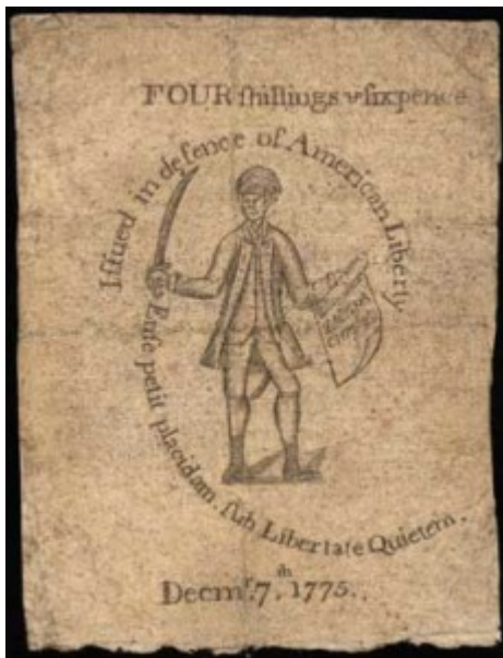
Fig. 1.

In the hands of critics, the persona of Paper Money becomes, not surprisingly, a charlatan. He speaks words the reader can never entirely trust, and he dramatizes the risks inherent in all forms of money that rely on verbal promises rather than tangible forms of wealth. When Benjamin Franklin penned an essay publicly supporting a 1775 issue of Continental dollars, for example, critics responded with a series of satiric pieces depicting Paper Money as a social-climbing masquerader. In these satires, man and money mislead readers in similar ways. Franklin is the humbug who fashions himself as learned by speaking a smattering of Latin. Paper Money, who not coincidentally bears Latin mottoes, is also an imposter of sorts: he proclaims a value that cannot be backed up by collateral.