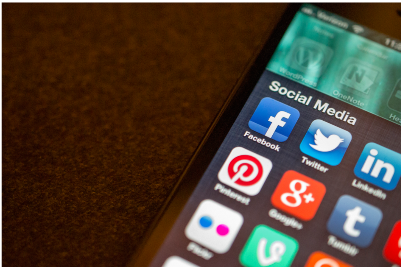
Figure 2: Social media mobile apps.

This movement followed the wide embrace of smartphones and a change in how internet users used their time online. In a recent article in The Atlantic entitled " The Age of Social Media is Ending ," Ian Bogost details a shift from social networking sites such as Friendster, Myspace, and others that focused on connecting users to one another to social media sites like Twitter that served more as a "channel through which to broadcast." Some social networking sites like Facebook or Instagram straddled the social networking/media line by relying on connections but evolved to focus primarily as a method to distribute content.