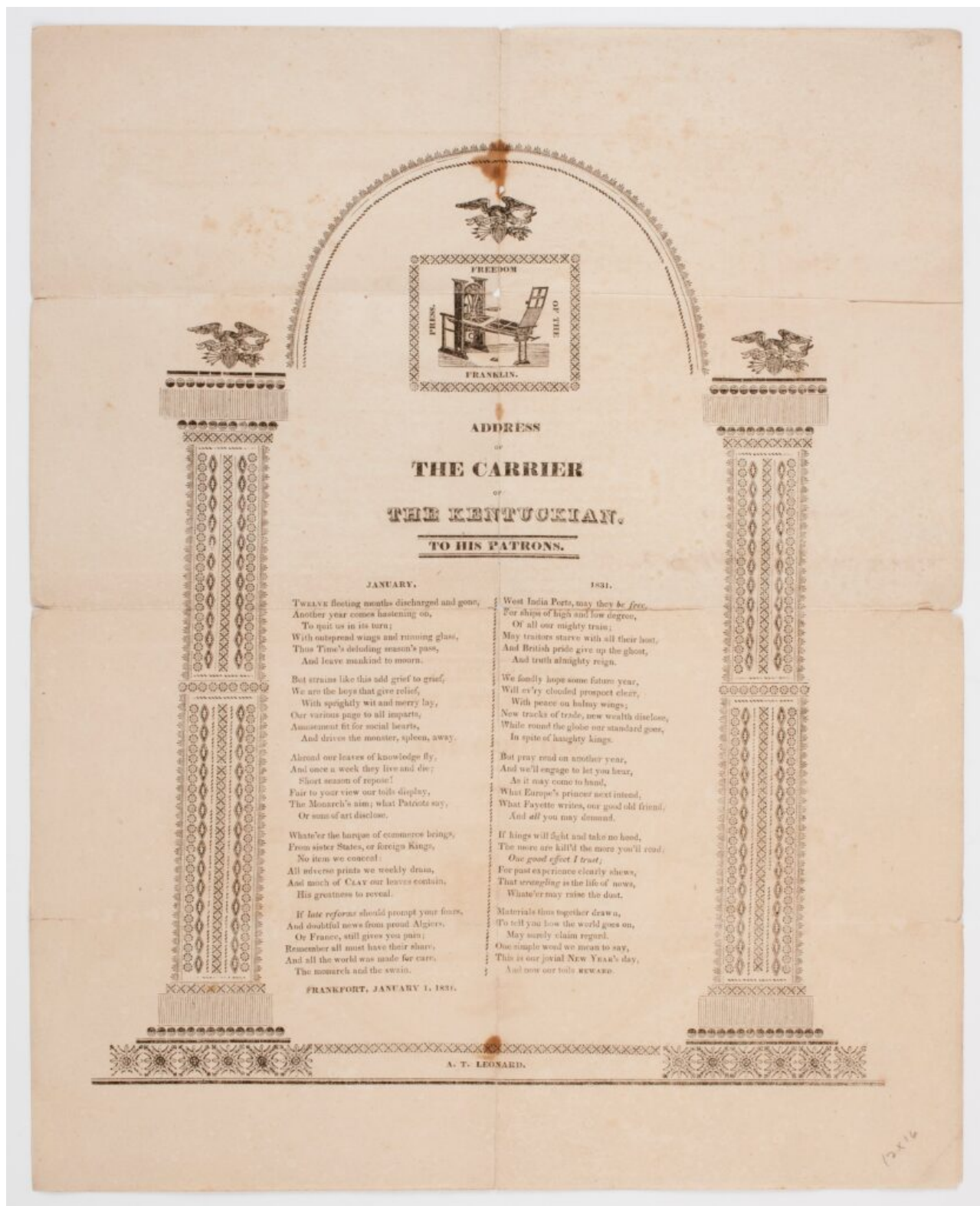
Figure 1: A broadside of a New Year's Carrier's Address with an image of a printing press labeled "Freedom of the Press." Address of the Carrier of The Kentuckian: To his Patrons (Frankfort, A. T. Leonard, [1830].

Before we get to the future, it might be helpful to look back at how Commonplace has attempted to engage its audience from the very beginning. In