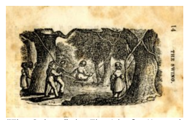
"The Swing," in The Little Keepsake; or Easy Lessons in Words of One Syllable (New Haven, Conn, 1825).

The publication of The Tawny Girl in 1823 anticipated a cluster of antebellum children's literature by antislavery white authors in which black girl characters functioned as protagonists who addressed slavery and racial inequality. The suffering, alienation, loneliness, and premature death of black girls in this literature are designed to evoke empathy in young readers and deliver an antislavery message. Widely circulated early American children's texts that feature black girls include Poems: Moral and Religious, for Children and Youth (1821); and Blessings in Disguise; or, Pictures of Some of Miss Haydon's Girls, by Caroline Chesebro. The Little Keepsake; or Easy Lessons in Words of One Syllable (1825) contains four brief chapters that teach lessons to children using racial themes. "The Swing" illustrates the separation of the races when a group of white children who "have just come out of school" are playing on a swing while a group of black children, two boys and a black girl, lurk behind a tree and "wait for their turn to swing." The author tells readers: "Soon our white young friends will go home, and then these will take their turn." The isolation of black children at school and at play is illustrated further by their labeling as "these" in this text, perhaps teaching young white readers less about tolerance and more about the hierarchical systems in place that separated the races.