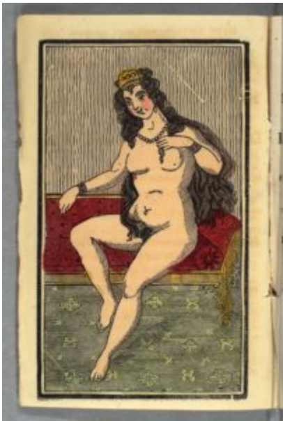
Frontispiece of Prostitution Exposed (New York, 1839).

reform activists worked fervently to eradicate prostitution. While such efforts began in the late eighteenth century, moral reform organizations grew at an accelerated pace beginning in the 1830s. As American cities began to grow rapidly in this period, prostitution flourished in tandem. Reformers responded with a variety of strategies: evangelizing, rescuing prostitutes who wanted to get out of the business, and warning Americans through spoken word and print about the many dangers that prostitution posed to individuals, families, and even the very social fabric of the United States. The movement expanded into an effort to suppress all forms of non-marital sexuality, including masturbation, and reformers' collective voice dominated nineteenth-century discourses about sexual matters. Moral reformers quickly became the dominant force in shaping popular ideas about human sexuality, advocating the repression of all sexual activity except within the sanctity of marriage. They stressed the new idea that prostitutes were victims of both economic circumstance and men's failure to control their own sexual impulses. They called upon middle-class women to exert their domestic power and shun such men from social gatherings.