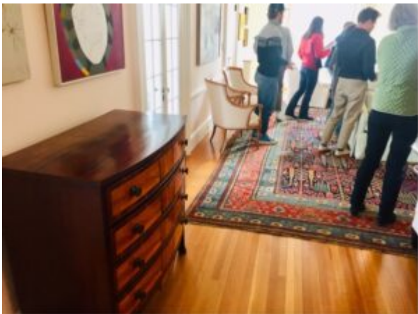
Figure 5: Chest of drawers in Sloan House during class visit, Williams College, March 4, 2020.

Who purchased and owned such an item, and what did they intend its display to communicate in their houses? What do its tiny keyholes indicate about evolving concepts of privacy and security? How may gendered processes of colonial familial inheritance and property ownership have shaped the intergenerational transits of this chest? Why did this item eventually wend its way from the Piscataqua River region of the Atlantic seacoast to the comparative rurality of western Massachusetts? Comparisons with similar furnishings from the region's workshops (some of which are sold privately at antiques auctions today or featured on the PBS Antiques Roadshow program) may provide one avenue for deepening our contexts for this particular piece and the capitalist marketplaces in which it exists. In addition, we might reflect on how individuals' own positions and interests shape the salience of such items. I know that this chest caught my attention partly because I grew up in New Hampshire, and recognize that the northern parts of "New England" have been comparatively less well represented in many historical accountings and collections than the southern reaches.