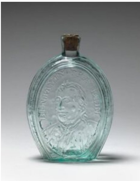
Figure 8: Glass flask bearing image of Benjamin Franklin (object GA.5), shown in standard catalog photograph rather than 3D rendering, Williams College Museum of Art.

The critical insights presented through this virtual transition were surprising. Beth explained how the photogrammetry process operates, affording insights into just how many decisions and subjective selections are made at every step to render the object. Objects that are too shiny or transparent do not make good candidates for scanning, so the very choice of materials to digitize is influenced by their physical properties. A glass flask bearing Benjamin Franklin's visage , produced at Kensington Glass Works in the 1830s and illustrative of the popular commodification of the "Founding Fathers" in the early U.S. Republic and antebellum era, was thus regrettably off the digital table. But the piggins' wooden surfaces worked well. This helped us understand scanning as interpretive work rather than "mere" mechanical replication. It is every bit as bound up in matters of judgment and analysis as other forms of inquiry.