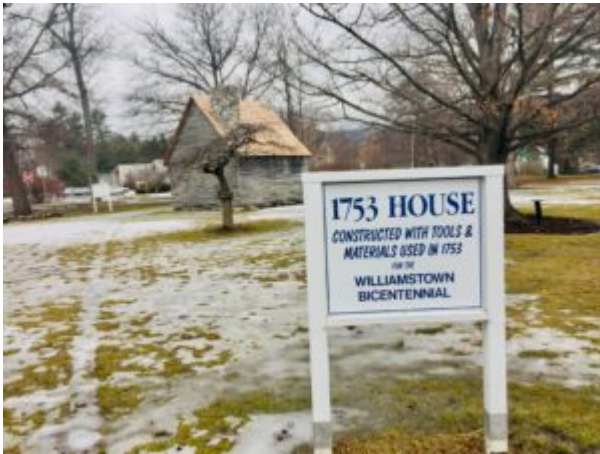
Figure 9: The replica “1753 House” in Williamstown, Massachusetts is a local colonial icon that has provided grounding for student research and critical interpretation. The house is shown before amended signage was added acknowledging its location in Stockbridge-Munsee Mohican Community homelands.