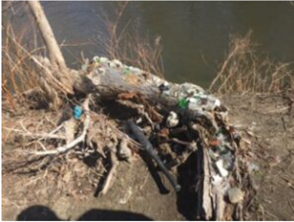
Figure 10: Found collections: assemblage of ceramics, glass, and other items along the Hoosac River, March 21, 2020.

Now that our campus (like so many others) is resuming in-person living and learning, I continue to ruminate on what lessons from the sudden remote turn will we carry forward, and which elements we will gladly leave behind. I recently discarded the hand-sewn mask I clumsily fashioned from a dishtowel in the spring of 2020, using the sewing kit I inherited from my late grandmother. Others are similarly deaccessioning—or preserving—the material traces of pandemic time. And they are delving into the pedagogical implications of the transformations we have experienced .