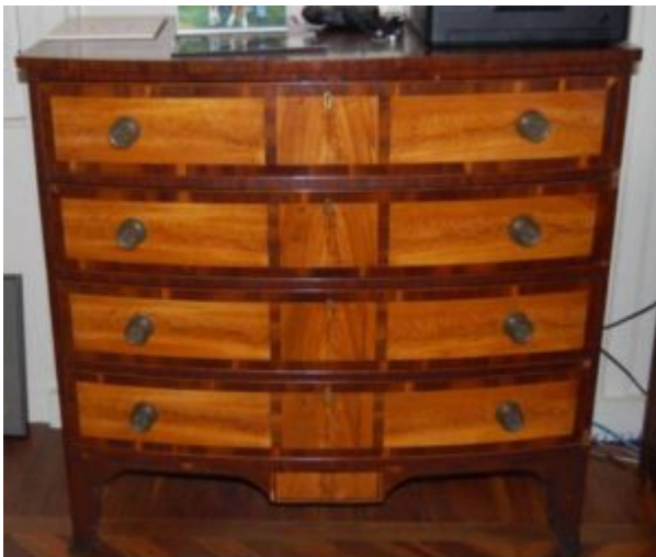
Figure 1: Museum catalog image for chest of drawers (object 43.2.12.A), Williams College Museum of Art. 35 mm. photograph by Rachael Tassone, Museum Registrar.

Hampshire between approximately 1795 and 1820 . The majority of catalog photographs at WCMA are carefully staged and lighted. But this one jumped out to me as seemingly taken under more provisional conditions. It resembles a Polaroid snapshot more than a studio portrait and implies something distinctive about the human life that surrounds it in the present day. Pieces of modern life peek in upon the historic chest. A family photograph perches atop it, as does a computer printer or other electronic gadget, while power cables snake behind it. Like the Google Street View images that capture unexpected human interactions with place , this snapshot directs us to different story of furnishings: their continuing re-purposing, re-signifying, and even contestation.