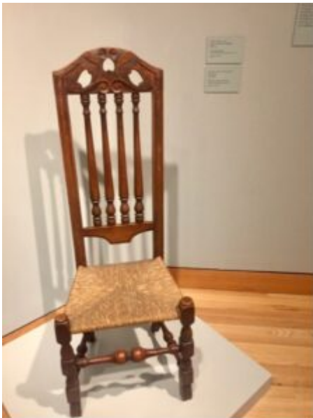
Figure 2: Chair on display in “Object Lab,” Spring 2020, Williams College Museum of Art (object 1875.1).

Running this course entails special considerations around colleagues’ labor. It is logistically complex and time intensive for museum staff members to retrieve bulky items like furniture from a remote storage space, pack them in protective materials so they don’t become scuffed, dinged, or torn, and arrange their transport to the main campus museum. Then staff must situate them in a busy building so that students and faculty can view them. The items pulled for the “Object Lab” installation developed in conjunction with this course in spring 2020 required a high level of planning and coordination. The one furnishing present—a wooden chair with woven seat—was included partly because of its relative lightness and portability. Items’ very materiality helps shape what is visible and accessible.