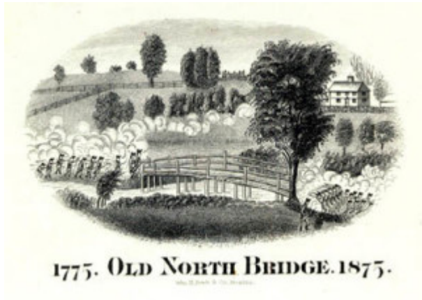
Fig. 3. Letterhead taken from the invitation for the Grand Centennial Military and Civic Ball on April 19, 1875.