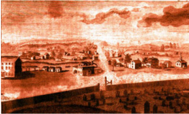
Fig. 1. A view of Concord taken from The Massachusetts Magazine , July 1794.

New England town should be," observed the Globe . "Concord, one of the oldest towns in the commonwealth, has retained through all the stress and strain of 275 years much of her pristine purity and most of her Puritan ideals." As the home of Puritans, minutemen, and Transcendentalists, Concord symbolized the New England tradition at its best.