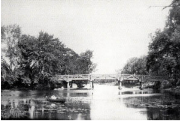
Fig. 4. Old North Bridge, Concord, Massachusetts, photograph taken by E.M. Perry, 1898. Courtesy of the American Antiquarian Society.

In such a placid setting, it is easy to see how Concord, with its rich heritage, attractive landscape, and literary associations, could become a retreat from the wider world. Local inhabitants were soon publishing tourist guides, which proliferated in the wake of Louisa May Alcott's great success with Little Women and its successors and after Walden became a pilgrims' Mecca. As early as 1862, a short-lived magazine entitled The Monitor was half-facetiously suggesting that visitors would be better off skipping the annual April 19 ceremonies and spending their time in the woods, where they might run into a local philosopher. "Leave business behind . . . Money, too, for there is nothing here that money will buy. Fashion as well, for it, alone, does not pass current here. Do not despise anyone you may meet in the woods, or up the river on account of their clothing."