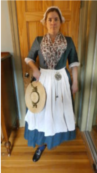
1. The author in eighteenth-century clothing.

The final stages of getting ready for my work commute resemble the preparations made by most professors: car keys must be located, along with student papers, lecture notes, and the mug of tea which accompanies me into my first class of the day. But some mornings include a few more steps culminating in a dilemma not faced by anyone born in the eighteenth century, namely relearning the art of driving a car while wearing shift, stays, petticoats, and gown. The petticoats get in the way of the gas pedal, the stays require sitting perfectly straight, and the sewing tools attached to the chatelaine at my waist hit against the clutch. But all these complications are worth the response when I walk into my classroom an hour later. "Wow," said a student the first time I taught a class in period clothing. "You really get into this" (fig. 1).