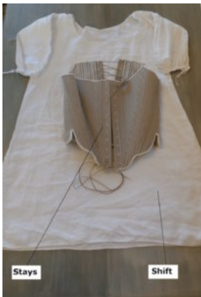
2. Linen shift and front-lacing stays.

spent years working at museums across the United States, and wearing period clothing was second nature to me long before I finished my own undergraduate degree (looking back, I don't remember telling this to any of my history professors). But teaching in a full set of period clothing requires an enormous investment, both personal and financial. At various points in my museum career, I've gone to the hospital in full period clothing with a head injury, purchased crickets for my sister's lizard on my way home from work, and delighted my cat when my milk-stained apron landed on the floor in the evening. Even with all those experiences, I once hesitated to change into my eighteenth-century clothing for a night class when the one female student in the class was absent. And well-made reproduction historical clothing is expensive. Some of mine is the result of my own labor with a needle and thread; the rest was purchased by my university when items such as a gown and stays were beyond my own sewing skills. Given these challenges, while this essay is focused on teaching in historical clothing, it also suggests other methods for using historical clothing in the classroom.