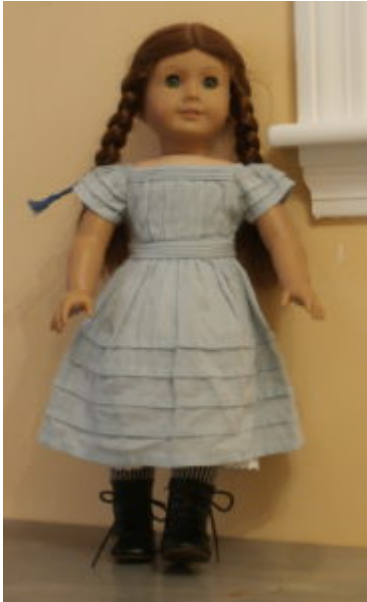
6. American Girl Doll Felicity in nineteenth-century clothing.

A few weeks later, a class on the rise of the middle class in the nineteenth century returns the “United States History to 1877” class to their ongoing examination of changing perceptions of childhood. This time, I bring an American Girl doll to class that is dressed in eighteenth-century shift, stays, stockings, gown, apron, kerchief, and cap as a reminder of children’s clothing in the colonial period (fig. 5). Once the class members have again familiarized themselves with clothing for children in the eighteenth century, I exchange her clothing for a dress from the nineteenth century, with pantaloons, chemise, socks and shoes. I ask the class what they notice, and they point out the difference immediately (fig. 6). Her body is no longer carefully molded by her stays (or corset, as they were known in the nineteenth century), and her dress reaches to her knees rather than the floor. Since I do not own nineteenth-century women’s clothing, I show them drawings, which make it abundantly clear that nineteenth-century women were still wearing full-length dresses. This lesson would be equally possible with drawings of children’s clothing or a scene from a historical film.