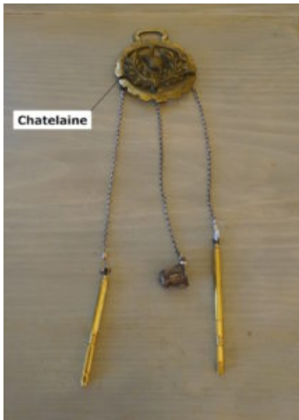
8. Chatelaine with sewing tools.

base and tapering to seven inches at the top, with a slit for reaching inside. It is heavily embroidered in blue and white wool, a summer project when I was in college. It holds my housewife, a roll of fabric filled with scissors, linen tape measure, buttons, thread winders, and pins. While I pass my pocket and its contents around the room, we consider the balance between utility and decoration. If pockets do not need to be covered with embroidery to fulfill their basic purpose of holding and transporting small objects, why did middle- and upper-class women in the colonial period embroider them? And, in turn, what purpose might this labor have served?