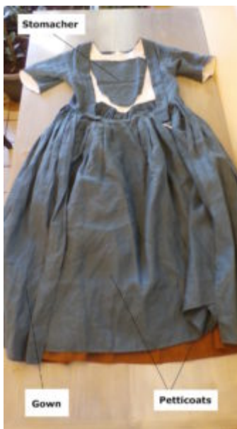
3. Linen gown, stomacher, and two petticoats.

I arrive in class on the assigned day wearing my eighteenth-century clothing, usually about five minutes before I plan to begin teaching. By that time, the first students are seated in the classroom. Sometimes there’s a sudden lull in the voices, other times the first response is immediately verbal. Students in the front rows often have questions about where my clothing came from, and I answer them informally. I begin class with a series of PowerPoint slides which introduce students to the early modern household with its complex blend of family and labor from the head of household at one end of the spectrum and servants or slaves (or both) at the other. These slides use images of historical interpreters from Colonial Williamsburg to illustrate the differences between the various social orders present in the early modern household. This exercise is easily replicated in class without historical clothing and can be further developed with Colonial Williamsburg’s “Dress the Part” activity, which is part of their larger “A Day in the Life” teaching series.