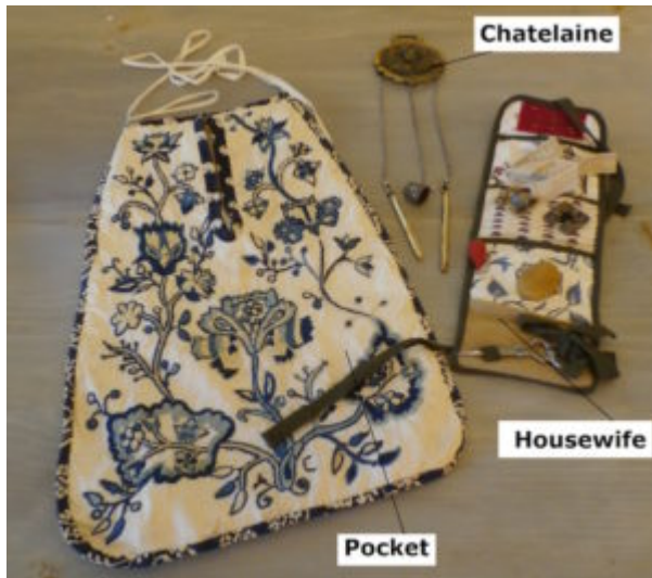
7. Embroidered pocket; housewife with sewing tools and chatelaine.