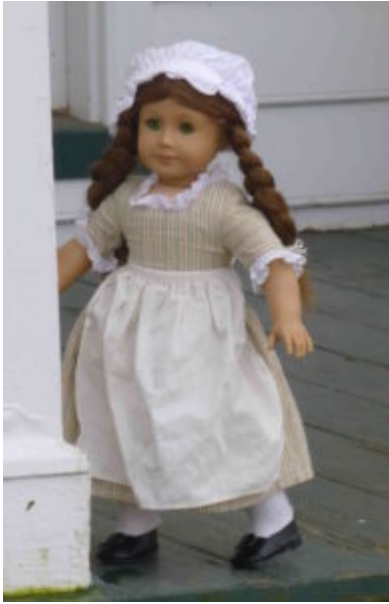
5. American Girl Doll Felicity in eighteenth-century clothing.

This last point from that first day of the semester can now be more fully explored as the discussion on household order moves into its next stage. I used PowerPoint slides with photographs of historical interpreters earlier in the class to introduce them to the hierarchy present in early modern households. Now I bring up more slides to show students paintings of women and men in the seventeenth and eighteenth centuries so they can see how clothing styles changed over the course of the colonial period. I deliberately use photographs of historical interpreters earlier in the class and paintings in this part of the class to help students focus on the portraits as pictures of once living people with different ideas from our own about how they might exist and function in the world.