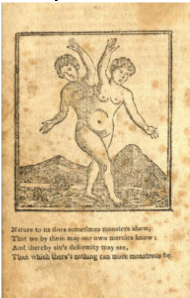
Woodcut illustration with poem, "Nature to us does sometimes monsters show..." from Aristotle's Master-piece, printed for the company of flying stationers (New York, 1812).

This article originally appeared in issue 17.3 (Spring, 2017).