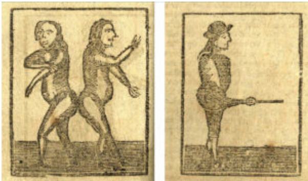
Woodcut illustrations of joined twins and a figure with "members wanting...supplied by other members" from Aristotle's Master-piece (New York, 1802), pp. 36-37.

less wholesome purposes, for aside from its religious discourse, sex is not metaphorized. Sex, the sexual body, intimate relationships, desire and pleasure, and reproduction are addressed frankly and with specificity. Therefore, Aristotle's Masterpiece could easily be considered a "dirty book." It is not hard to imagine the allure of such a work for readers—modest or otherwise—for it provided a rare detailed discussion of sex. It even included illustrations.