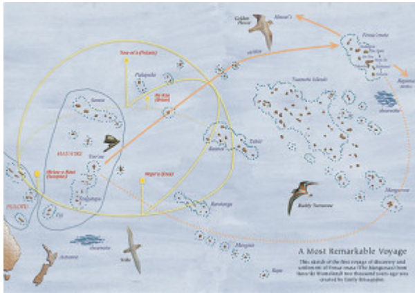
Fig. 2. The first voyage of discovery and settlement of Fenua'enata. Map by Emily Brissenden.

These Sea People are not in their land more than two or three hundred years when they are restless for discovery. They follow the Golden Plover into the Northern Hemisphere and on to Hawai'i. We do not know what takes them on to the loneliest island in the Great Ocean, Rapanui. They are there a thousand years before the Dutch give it the name of Easter Island. The spill of the wind takes their va'a to Tahiti. The annual procession of millions of yolla—the shearwater, the mutton-birds—takes them even further, to Aotearoa (New Zealand).