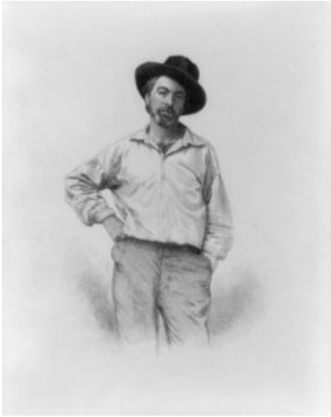
Figure 3: Walt Whitman, 1819-1892.

Whitman specifies that the armed, soldiering boys are making their excursions “North and South.” John Brown made his famous foray to Harper’s Ferry, Virginia in October 1859 and was executed that December. Clearly, the two boys are not like John Brown—a puritanical rebel whose scorn for American statutes came from his sense of higher, sacred laws. They own no law less than their selves; they are seeking their own freedom, not anyone else’s. But by writing “North and South” Whitman creates a fantasy world in which North and South are united, not by laws and morals, but by amoral adhesion and passion.