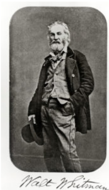
Figure 2: Walt Whitman, 1849. Between 1849-1850 Photograph.

Whitman surprises the reader by portraying himself as a boy, despite the fact that he turned forty in 1859 and had long sported a gray beard. The word “boys” does many things in the poem. It signals that the poem is a poignant dream, a wish-fulfillment, a foray into the imagination. It makes the lovers fully equal—not prophet and acolyte, or poet and reader. It makes the armed thieves less menacing, suggesting that their excursions are more playful than destructive. It makes the lovers less erotic—more “innocent” of lust—than if the poem read, “We two men together clinging.”