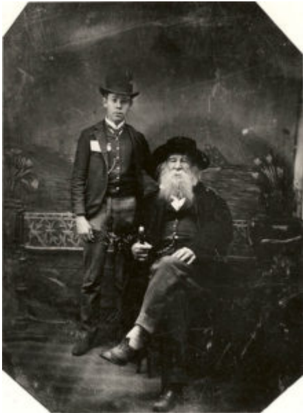
Figure 5: Walt Whitman and Bill Duckett, 1886.

springing on prey. The lovers are equal, even identical; at no point does he differentiate them (which, given Whitman's usual patterns of language, strongly suggests that they are both male). In many of the images, the lovers are parallel—oaks growing side by side, fishes swimming in the sea together—but in one crucial line they mingle: "We are seas mingling—we are two of those cheerful waves, rolling over each other, and interwetting each other." As in "We two boys," love achieves liberation by spurning society; as he writes in the triumphant last line: "We have voided all but freedom, and all but our own joy."