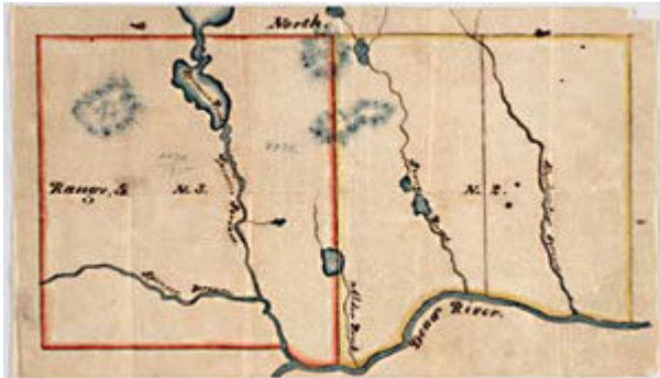
“Somerset County, Maine map.” Oriental Bank (Boston, Mass.) and Nahant Bank (Lynn, Mass.) Records.

learn about the global reach of American commerce by reading a transoceanic correspondence between Boston merchant John Perkins Cushing to his partner, the Chinese merchant Houqua, observing that the “immense speculation in wild lands” in the American West meant “every description of property has fallen in a most alarming degree.” The partnership dissolved when Cushing shifted his resources and energy to financing railroads, a logic which guided many who were similarly prompted by the crisis to channel their money away from maritime trade and toward industrial investments.