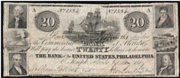
“Twenty Dollar Bank Note from the Bank of the United States, Philadelphia, 1837.”

Most textbooks cite the failure of Jay Cooke’s banking house in New York as having triggered the crisis of 1873. But “Bubbles, Panics, & Crashes” widens our perspective beyond the immediate national context by shedding light on the destabilizing role of European investment in American railroad securities. In this light, the United States appears as less of an industrial power in its own right and becomes something of a developing nation, flooded by foreign capital during a European credit bubble, and then left teetering when the money supply swiftly contracted. Thus, alongside images of the Northern Pacific Railroad cutting through vast, sparsely settled territories, the exhibition traces the web of capital to Germany, whose leading financiers helped underwrite that railroad’s construction. The hand-drafted contracts establishing Cooke’s business presence in London (a common practice for all major American financiers), and forming an all-star financial syndicate of American and English banking houses (including Cook, Morgan, Barring, and Rothschild), again