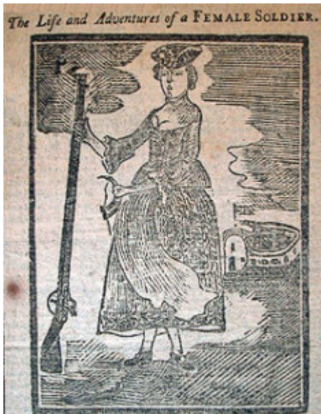
Fig. 3. Hannah Snell, as depicted in an excerpt from "The Life and Adventures of a Female Soldier," the narrative of the most famous cross-dressing British soldier of the century. It appeared in Isaiah Thomas's New England Almanack (Boston, 1774). Printers recycled the image on other imprints.