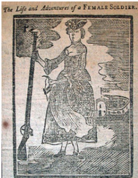
Fig. 3. Hannah Snell, as depicted in an excerpt from "The Life and Adventures of a Female Soldier," the narrative of the most famous cross-dressing British soldier of the century. It appeared in Isaiah Thomas's New England Almanack (Boston, 1774). Printers recycled the image on other imprints.

SP: In addition to women's history, Masquerade also required knowledge of new scholarship on the history of gender and sexuality. What drew you to those fields?