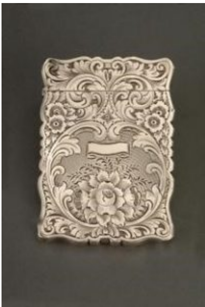
4. Letitia Tyler's silver calling-card case.

Although the style of a card may have fluctuated over the course of the nineteenth century (at least among the ill-bred), its basic structure changed little. Women carried cards about three and a half by two and a half inches, often in a special case. Men carried smaller cards, which were better suited for a breast pocket. Younger women with shorter names sometimes used square cards. The street address, but not the city, was occasionally engraved on the lower right-hand side, although such an addition was rarely needed until the late 1800s. Those either new to the city or visiting wrote their temporary residence on the card.