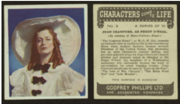
9. Joan Crawford as Peggy O'Neale Eaton in the 1936 movie "The Gorgeous Hussy," front and back of card. From the New York Public Library collection of cigarette cards, "Characters come to life: a series of 36."