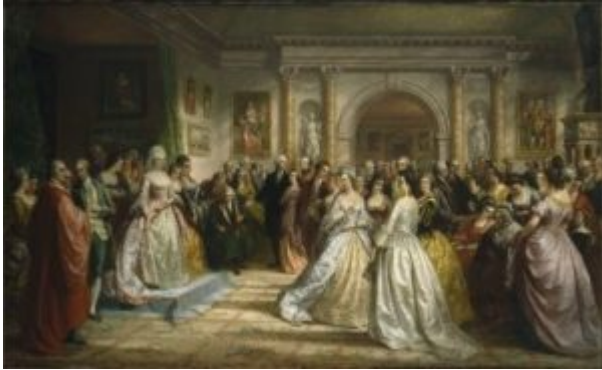
6. A fanciful interpretation of first lady Martha Washington's Friday evening drawing room. The Republican Court (Lady Washington's Reception Day) by Daniel Huntington (American, 1816-1906), 1861. Oil on canvas, 66 x 109 1/16 in. (167.6 x 277 cm). Brooklyn Museum, gift of the Crescent-Hamilton Athletic Club, 39.536.1.

Household servants were well trained to accept calling cards at the door, perhaps with a small tray in hand. Visitors placed their cards on the tray and departed, or if staying for a visit, were escorted into the sitting room. Ladies never handed their cards directly to the mistress. If a household received a card by post, an acceptable custom under certain conditions, it was removed from its envelope before being placed on a hall tray. The cards that gathered on the front table provided evidence of one's social standing and visual reminders of reciprocal responsibilities.