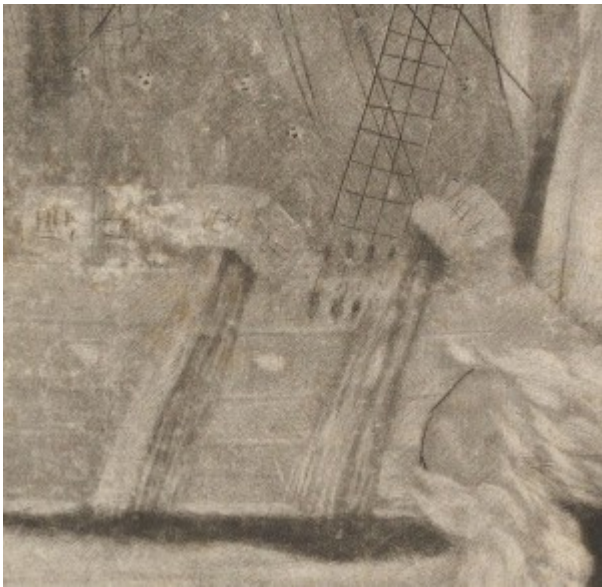
10. Detail of worn, damaged impression, Bostonians Paying the Excise-Man, or Tarring & Feathering . Fourth state. The Metropolitan Museum of Art, Gift of William H. Huntington, 1883.

collection of the Metropolitan Museum of Art likely numbered between the 400th and 500th impression to be pulled (fig. 9). At some point in the history of the plate's wear, an engraver used a needle to etch additional lines into the copper's soft surface to attempt to reconstruct facial features and separate layered forms, such as dividing hat brims from faces or knees from ships (fig. 10). But when compared with the many variations of light and shadow that model the earlier state of the print, we see the image dissolving before our eyes (fig. 11). The figures of the Americans on the ship in the background have literally faded out of the picture, while the separations between masks and skin have worn away, so that the masks worn by the foreground figures in the first state have become their permanent expressions.