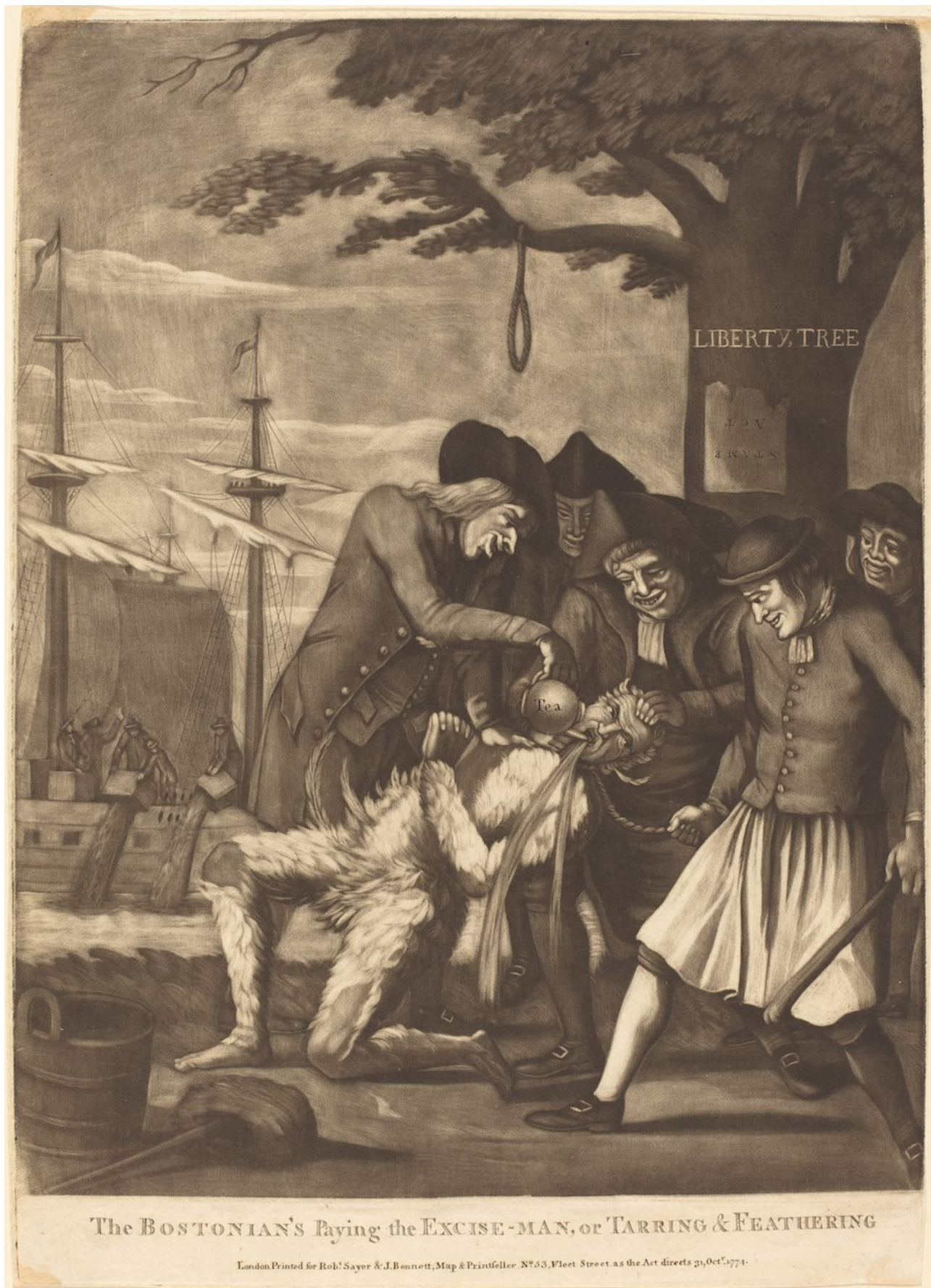
On a frigid Boston night in January 1774, a crowd of American colonials tarred