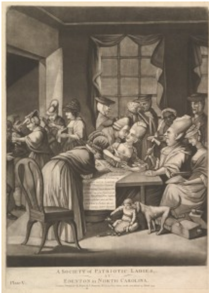
8. A Society of Patriotic Ladies, at Edenton in North Carolina , Samuel Hieronymus Grimm (designer), engraver unidentified. Published by Sayer & Bennett (London, March 25, 1775). Mezzotint, first state, 13 7/8 x 9 15/16 in. (35.3 x 25.3 cm).

Boston Port Bill, but so did public acts of protest carried out in American streets and homes. Between November 1774 and March 1775, Sayer & Bennett issued four additional mezzotints representing acts of American rebellion; in this series, Bostonians beg for assistance from neighboring colonies (fig. 5), barbers refuse to shave British naval officers in New York (fig. 6), merchants are coerced into signing non-importation agreements in Virginia (fig. 7), and women boycott tea in North Carolina (fig. 8). Taken together, these five prints—linked by the addition of a plate number at the lower left of each—visualized the threatening power of colonial unity.