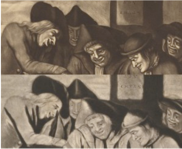
11. Details, Bostonians Paying the Excise-Man, or Tarring & Feathering . First state (top), fourth state (bottom).