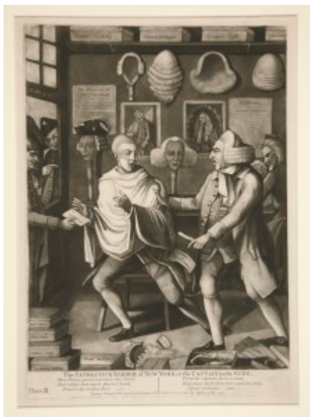
6. The Patriotick Barber of New York, or The Captain in the Suds , designer and engraver unidentified. Published by Sayer & Bennett (London, February 14,