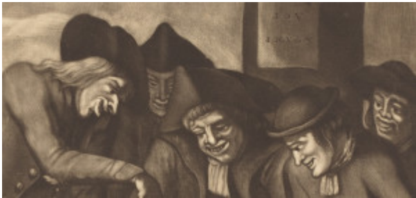
4. Detail, Bostonians Paying the Excise-Man, or Tarring & Feathering. First state.