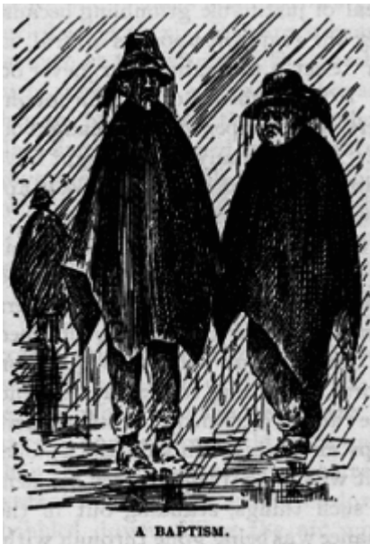
Fig. 1. Shorty and Si endure their first "baptism" wearing army rain ponchos. George Coffin, from Corporal Si Klegg and his "Pard" by Wilbur Hinman (Cleveland: N.G. Hamilton & Co., 1889). Courtesy of the author.

book first appeared, memoirs and histories of the war were at the height of their popularity. But Si Klegg was something different. It dealt not with generals and grand campaigns, or even the exploits of a single regiment. Instead, Hinman's book was about the dirty, miserable, and joyful minutiae of soldier life in the Union army. The non-violent use of the bayonet as a candlestick or roasting skewer was far more fascinating to Hinman than the movement of divisions and brigades (fig. 3). Instead of quantifying the millions of pounds of flour and pork issued to the armies, he reveled in describing the personal experience of eating hardtack, "swine's flesh," and "desecrated vegetables." Si's first taste of military food prompts him "to realize what it was to suffer for his country."