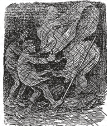
A CYCLONE IN CAMP.