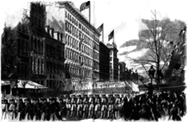
Fig. 7. Civil War soldiers saw themselves illustrated from the moment they marched off to war, as in this image from Harper's Weekly in May 1861. Click image to enlarge in a new window.

triumphs. Si Klegg was endearing to both former soldiers, who could laugh knowingly and nod in remembrance, and non-veterans, who enjoyed the humor and discovered new and remarkable details of army life with every page.