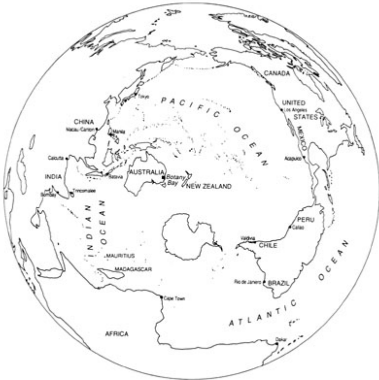
Australia in relation to the East Indies and the Pacific coastlines