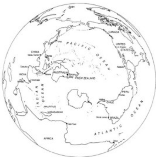
Australia in relation to the East Indies and the Pacific coastlines