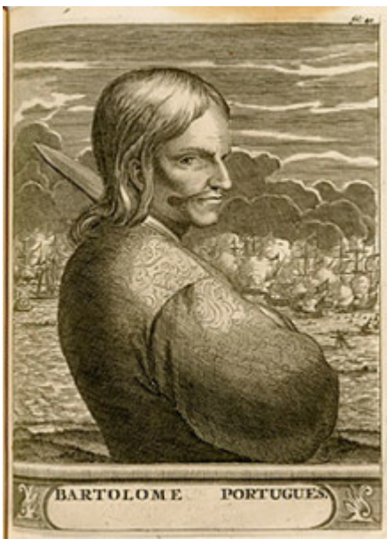
6. "Bartolome Portugues," from the original 1678 Amsterdam edition of Exquemelin's Bucaniers .

Jones as the emblem of America as created through Melville's paradoxical layering ("à-la-mode [but not] altogether civilized...") criticizes the American practice of myth-making even as it creates a maritime frontiersman as its "Representative Man," to use Emerson's term. Although Melville's Jones resembles the lonely backwoodsman of much of the frontier literature of the period, the Jones of Israel Potter appears as Indian rather than as an "Indian-fighter" like other frontiersmen. Of course, Melville's representative American displaces Native Americans even as he assumes so-called "Indian" characteristics. By comparing Jones's manner to "a look as of a parading Sioux demanding homage to his gewgaws" and determining the captain's seated posture to be "like an Iroquois," Melville prompts the reader to rely on stereotypical "stock" poses for Native Americans created by literature and then directs the reader to assign these characteristics to Paul Jones. These descriptions co-opt familiar notions of indigenous peoples to disguise the Scottish Jones in "native" legitimacy while dressed as the very English enemy he sought to destroy.