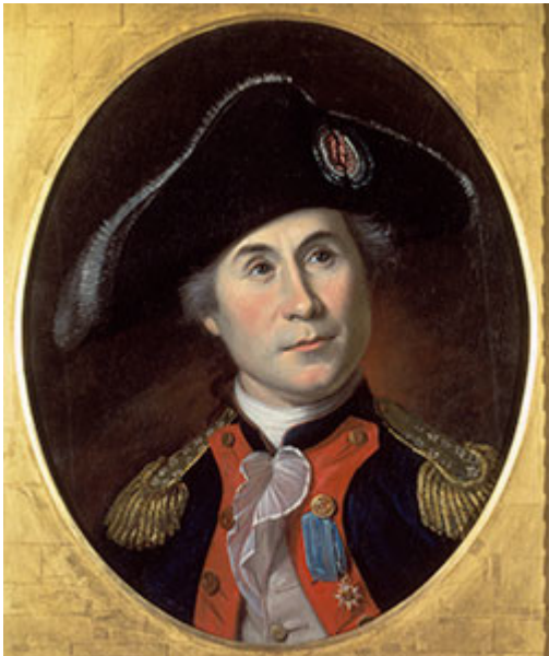
2. Portrait of John Paul Jones, by Charles Willson Peale, from life (c. 1781-1784), INDE 11886.