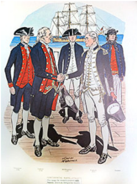
1. From Uniforms of the United States Navy: 1776-1898, plate 1.