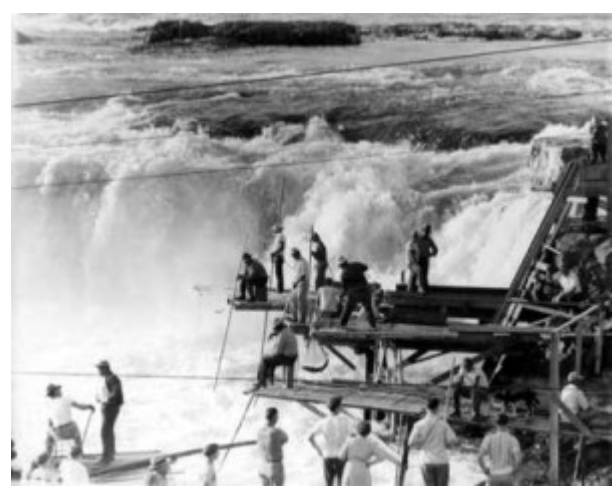
Both fishermen and lookers-on were hypnotized by the deafening roar of the river at Celilo.