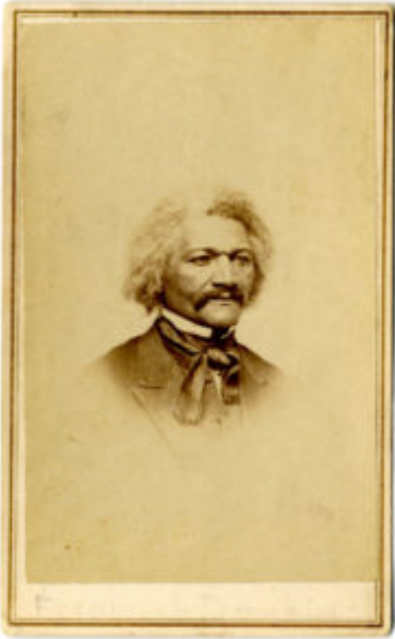
Carte-de-visite photograph of Frederick Douglass