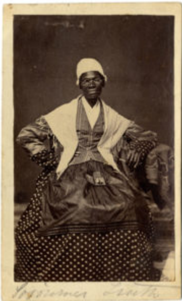
Carte-de-visite photograph of Sojourner Truth, photographer unknown. Courtesy of the American Antiquarian Society, Worcester, Massachusetts.

Too often, African American biographies function as isolated, at times almost random, historical markers on an otherwise unmarked historical landscape. Instead of marking important sites of public memory, complex networks of only loosely associated or even contesting narratives of the past, and therefore forums for debate or for complex social and political negotiations, African American biographies tend to operate as isolated but all too familiar stories, tales of exceptional individuals. Biographies offer a kind of closure, a sense of resolution, of completeness. Arguably, a biography of Frederick Douglass should force one to realize how much about Douglass's life and his world remains unknown, but it is all too possible for many readers to get through a biography of Douglass without even realizing that one has encountered very few African Americans along the way, that the biography's index is populated primarily by white people, and that the documentary record favors the white American's reading of history, even of black history, even of Douglass's life.