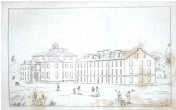
Fig. 4. Almshouse, from Fielding Lucas, Picture of Baltimore . The elderly and disabled inhabitants of the Baltimore almshouse were outnumbered by the able-bodied poor who performed compulsory labor at the institution.

That might have been a little strong, but Baltimore's diversity was nonetheless noteworthy. In 1820, Baltimore had the largest African American population of any city in the nation. With 4,357 slaves and 10,326 free blacks, more people of color resided in Baltimore than in New York, Philadelphia, Charleston, or New Orleans. Although African Americans comprised only one-quarter of Baltimore's total population, their numbers constantly drew the attention of travelers coming from northern locales. The majority of black Baltimoreans were free, but Baltimore's hybrid economy witnessed a large number of enslaved men and women living on their own, earning wages, or finishing a term of labor in exchange for a promise of manumission. While people of color had few