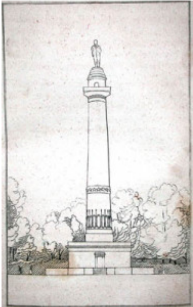
Fig. 2. The Washington Monument, from Fielding Lucas, Picture of Baltimore . Baltimore's other nickname was "The Monumental City" thanks to its tributes to George Washington and to the heroes of the 1814 defense of the city.

enough time to build an urban infrastructure, to create functioning institutions, and even to erect the nation's first monuments to the veterans of the War of 1812 and to George Washington. But it wasn't close to enough time to anchor Baltimore against the forces of disorder endemic to the first decades of the nineteenth century.