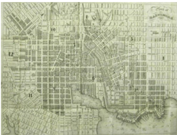
Fig. 1. Baltimore in 1832, from Fielding Lucas, Picture of Baltimore (Baltimore, 1832).

Although the tension between order and disorder was not unique to the first decades of the nineteenth century, scholars have interpreted much of this era's history around these poles. The democratization of electoral politics, the proliferation of competing religious sects, and a new boom-and-bust economy unmoored individuals, families, and communities from previous forms of hierarchy, gender structures, and class relations. Rapid economic development spurred social mobility and the growth of cities, where strangers brushed shoulders across lines of race, gender, ethnicity, and class. Rather than the foundations of good order, democracy and capitalism augured disorder and dislocation in the early republic. It fell to a new middle class to impose its own notions of order upon urban spaces and urban residents. This struggle pit women against men, whites against blacks, native-born against immigrants, the saved against the damned, democrats against aristocrats, and the economically ascendant against the downwardly mobile.