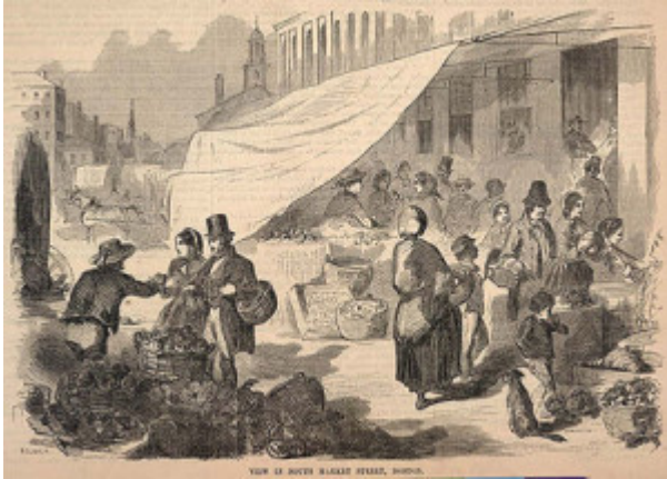
Fig. 3. “View in South Market Street, Boston,” Winslow Homer, (6 5/8 x 9 5/8 in.) from Ballou’s Pictorial Drawing-Room Companion (October 3, 1857).

domestic pigeons are raised to one month of age and sold as squab, a business that has its own rich history extending for seventy-five years and more. The Palmetto Pigeon Plant of Sumter, S.C., is an example of a modern business that, in the absence of wild flocks to “harvest,” raises pigeon and their kin for research and the table. They are in the business of “supplying millions of squabs throughout the world.” Proudly, they reveal that “our squab has been served on plates of Kings and Queens, Presidents, Prime Ministers, dignitaries, and other lovers of great food because of the quality they demand.”