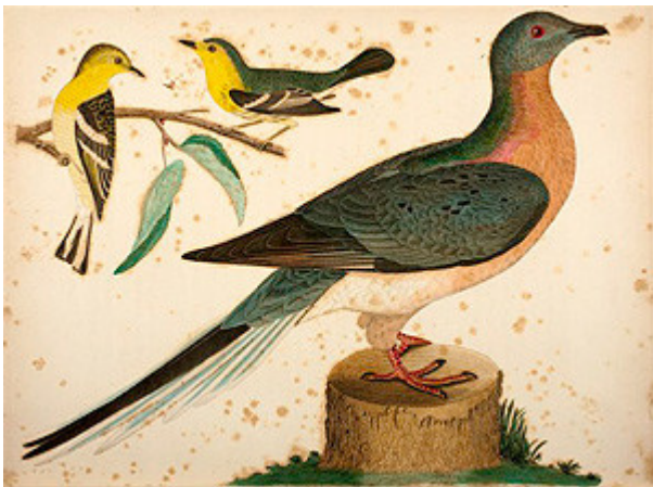
Fig. 2. Male and female passenger pigeon. Alexander Wilson, American Ornithology, or: The natural history of the birds of the United States, 9 vols. (Philadelphia: Bradford and Inskeep, 1808-14) 5: 110-13. The accompanying text refers to the “vast numbers” that are shot and the “waggon loads of them that are poured into the market...[so that] pigeons become the order of the day and dinner, breakfast and supper until the very name becomes sickening.”

Pigeon, as we have seen, was readily available, so these recipes remained useful even for American authors who were not suggesting extensive and