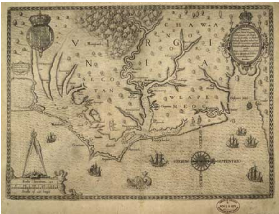
Engraving by Theodor De Bry after John White's drawings, 1590.