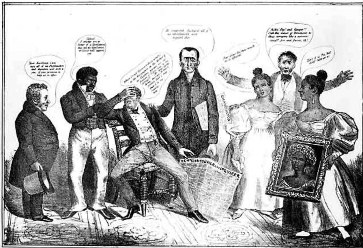
AN AFFECTING SCENE IN KENTUCKY.