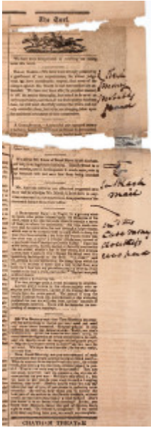
Fig. 4. Section titled "The Turf," from The Flash , November 6, 1841, New York, N.Y., with James Whiting's annotations.