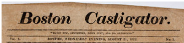
Fig. 2. Masthead of the Boston Castigator, 21 August 1822, Boston, Massachusetts.