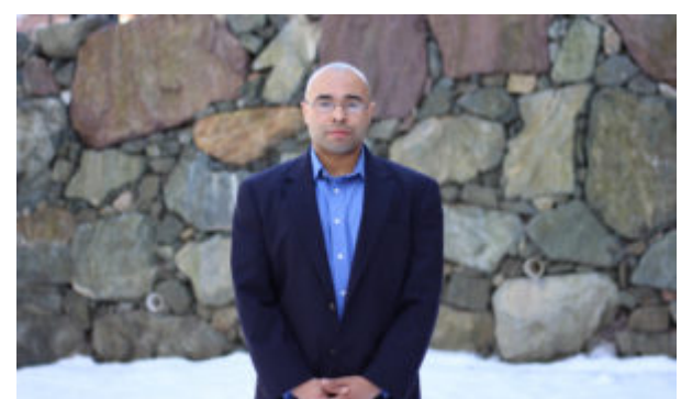
This is a picture of the author

One of the central arguments of To Plead Their Own Cause is to reframe the chronology of the abolition movement away from the traditional focus of historians on the antebellum era. How does that chronological shift change our understanding of the process of abolition?