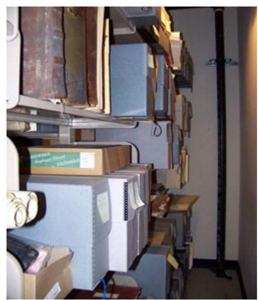
Fig. 1. What discoveries lie within? Manuscripts and archives representing over one hundred and eighty years of collecting by the Connecticut Historical Society, seen in the manuscript stacks in 2007.

took a year to examine, record, and put into a searchable database of more than 18,000 records. That was while still doing my regular duties—answering reference questions and arranging and cataloging newly acquired collections. For the inventory, I opened every box and every volume to record very basic information, like the call number, the creator (author) of the collection, a brief title with dates (such as "Diary, 1750"), whether there was a record of this being a gift or a purchase, whether or not there was any organization to the collection, and a brief note on the size or extent (1 box; 30 volumes; 10 cartons). I also went through all 24 volumes of our accession records looking for manuscript gifts and purchases. Then I checked our card catalog and the online catalog (which has items added to the collection since 1984) to determine if researchers could find the collections using the tools already at hand.