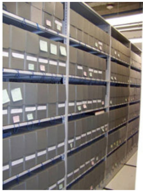
Fig. 2. Manuscripts and archives now ready for researchers' use at the Connecticut Historical Society. Rehousing and creation of online catalog records was accomplished with support from a Basic Projects grant from the National Historical Records and Publications Commission.

The inventory made it very obvious that over a third of the manuscript collections (5,542) had no records in the online catalog; nine percent (1,520) had no record at all; and ten percent (1,860) had never been organized (processed) for researchers to use. Unless you had access to browse the closed stacks, as I did, there was no way to know these collections existed, and there were no plans to provide non-staff access to the inventory.