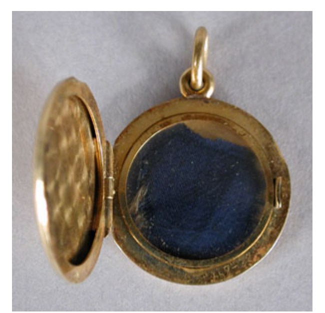
Fig. 4. Like many Civil War veterans, Kellogg treasured and carefully preserved a fragment of his regiment's battle flag. Gold locket, ca. 1865, containing a scrap of navy blue fabric. An inscription on the outside (not visible) records the place and date of Kellogg's capture by Confederate forces: "RHK" and "Plymouth NC / April 20, 1864 / Flag 16th / Regiment C.V."