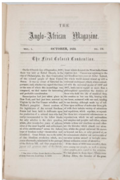
"The First Colored Convention," Anglo-African Magazine , p. 1, Vol. 1, No. 10 (October, 1859).

The printing committee foresaw the financial difficulties of sustaining a newspaper such as this, which, they predicted, would require 2,000 regular subscribers. As an alternative, the committee recommended designating an existing paper to play the envisioned role. One year later, at the Colored National Convention of 1848 in Cleveland, Frederick Douglass's recently established North Star was identified as serving the function of a national Black newspaper.