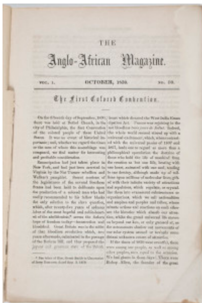
"The First Colored Convention," Anglo-African Magazine , p. 1, Vol. 1, No. 10 (October, 1859).

The printing committee foresaw the financial difficulties of sustaining a newspaper such as this, which, they predicted, would require 2,000 regular subscribers. As an alternative, the committee recommended designating an existing paper to play the envisioned role. One year later, at the Colored National Convention of 1848 in Cleveland, Frederick Douglass's recently established North Star was identified as serving the function of a national Black newspaper.