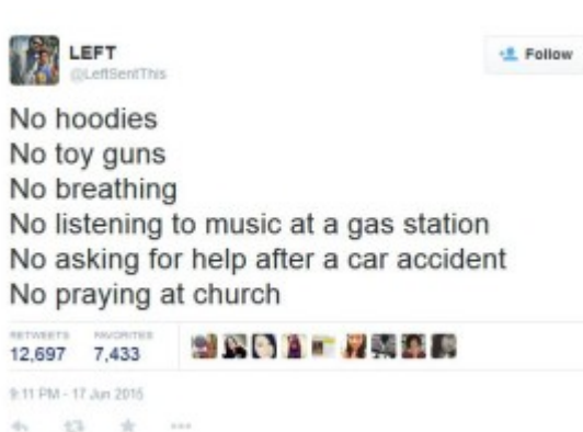
5. Screen shot from Twitter, June 17, 2015.

Why embark on this digital project as Black people again must ask whether or not—in our everyday lives—the masses can be included in the broader body politic at this late date, while evidence mounts that the answer is still “no” (fig. 5).