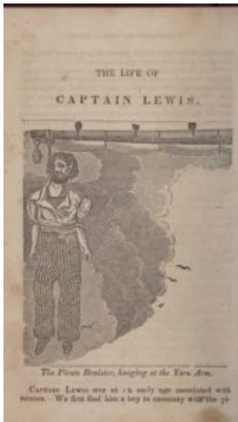
Figure 2: Image of Captain Lewis hanging from the yard arm. Charles Ellms, comp., and Samuel Nelson Dickinson, The Pirates Own Book (Portland, ME, F. Blake, 1856).