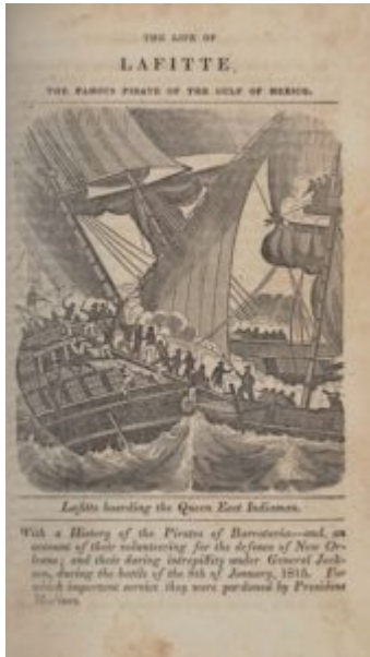
Figure 5: Jean Lafitte the Patriot-Pirate. Charles Ellms, comp., and Samuel Nelson Dickinson, The Pirates Own Book (Portland, ME, F. Blake, 1856). Retrieved from the Library of Congress.

Ellms's writing style further undermines any presumption that all pirates are bad. Although he lifted from newspapers, pamphlets, and Johnson's General History , Ellms modernized the language and punched up the drama. Readers are made to sweat, scream, and cringe at the actions of scallywags; they are put in the moment with the pirates. Compare two scenes from Mary Read's life, one from Johnson and one from Ellms. In both, the pirate Mary Read has fallen in love with a young sailor, revealed herself as a woman, married him, and then decided to fight her husband's challenger instead of risking his death. According to Johnson, Mary "was to the last Degree uneasy and anxious, for the Fate of her Lover; she would not have had him refuse the Challenge, because, she could not bear the Thoughts of his being branded with Cowardise; on the other Side, she dreaded the Event, and apprehended the Fellow might be too hard for him." Johnson continues on about the nature of love, finally ending with Mary meeting the man who will duel with her lover, and fighting him "at Sword and Pistol, and [killing] him upon the Spot." The scene belabors Mary's emotions, presenting them both formally and in universal terms, only to hurry through her murderous action.