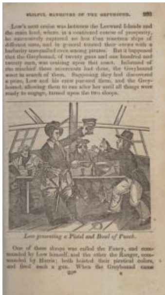
Figure 4: Ned Low, a Pirate with Boston connections. Charles Ellms, comp., and Samuel Nelson Dickinson, The Pirates Own Book (Portland, ME, F. Blake, 1856).