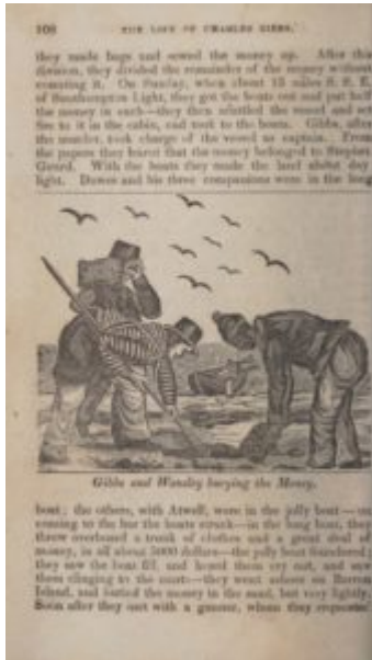
Figure 7: A group of pirates burying treasure. Charles Ellms, comp., and Samuel Nelson Dickinson, The Pirates Own Book (Portland, ME, F. Blake, 1856).