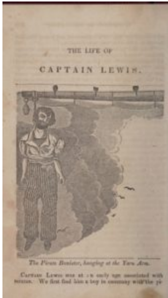
Figure 2: Image of Captain Lewis hanging from the yard arm. Charles Ellms, comp., and Samuel Nelson Dickinson, The Pirates Own Book (Portland, ME, F. Blake, 1856).