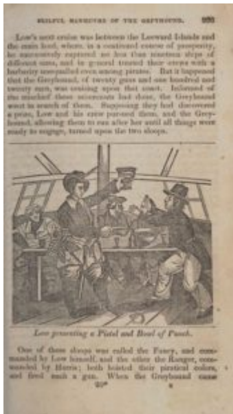
Figure 4: Ned Low, a Pirate with Boston connections. Charles Ellms, comp., and Samuel Nelson Dickinson, The Pirates Own Book (Portland, ME, F. Blake, 1856).