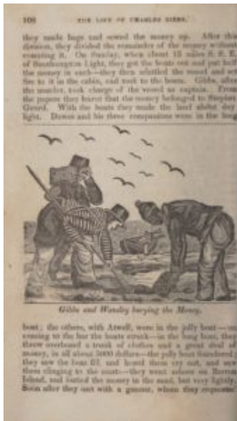
Figure 7: A group of pirates burying treasure. Charles Ellms, comp., and Samuel Nelson Dickinson, The Pirates Own Book (Portland, ME, F. Blake, 1856).