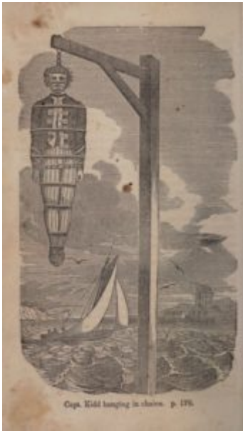
Figure 3: A gibbeted Captain Kidd. Charles Ellms, comp., and Samuel Nelson Dickinson, The Pirates Own Book (Portland, ME, F. Blake, 1856).