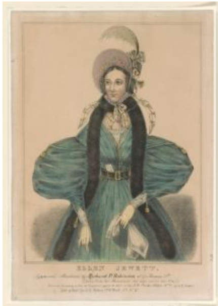
Figure 1: Lithograph of Helen Jewett (1836). Courtesy of the Library of Congress. Ellen Jewett. Popular Graphic Arts, Public domain, via Wikimedia Commons .