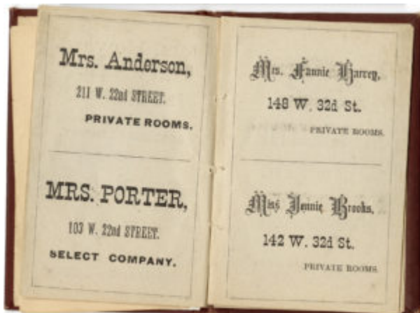
Figure 4: Pages 4 and 5 of the brothel guide Visitor's & Citizen's Guide, of Pleasure & Amusement in the City of New York (1880). Courtesy of the Library Company of Philadelphia.

the Gentlemen's Pocket Directory (1876) and Visitor's & Citizen's Guide, or Pleasure & Amusement in the City of New York (1880), only included the madams' name, address, and the class of the brothel. This printing layout spoke to those of the upper classes who used calling and visiting cards as a part of their communication process. Nineteenth- and early twentieth-century etiquette books described the correct process, design, and name use in calling cards. Unmarried women, for example, would list their name beginning with "Miss." Brothel listings possess a mixture of both "Mrs." and "Miss," as sex work was not exclusive to single women, but was also an occupation for married women. The guides targeted middle- and upper-class men by mimicking their class's calling card practices.