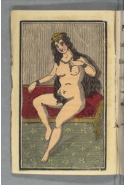
Figure 3a/b: Frontispiece and Dedication page (below) of the brothel guide Prostitution Exposed (1839). Butt Ender, Prostitution Exposed: or A Moral Reform Directory: Laying Bare the Lives, Histories, Residences, Seductions, &c. of the Most Celebrated Courtezans and Ladies of Pleasure of the City of New-York, : Together with a Description of the Crime and its Effects, : as also, of the Houses of Prostitution and Their Keepers, Houses of Assignment, Their Charges and Conveniences, and Other Particulars Interesting to the Public. (New-York: Published for public convenience, 1839).