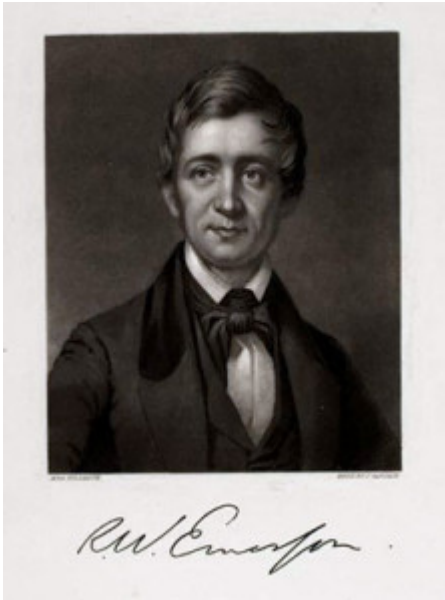
Portrait, "R[alph] W[aldo] Emerson," mezzotint by John Sartain after Mrs. Hildreth, taken from The Drawing-Room Scrap Book (Philadelphia, 1850).