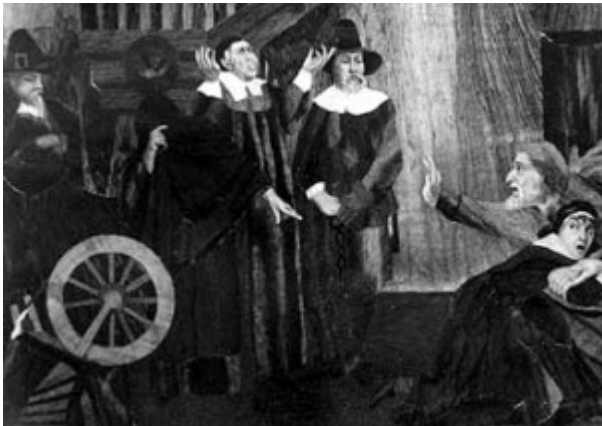
Fig. 1. Detail from Accusation of a Witch by Elias C. Larrabee Jr. (1885), collection of the Peabody Essex Museum, Salem, Massachusetts.

request, recognizing the volume as the devil's book. She also reported that the malefic cleric had confessed bewitching other people and recruiting a Topsfield teenager, Abigail Hobbs, into the ranks of the witches.