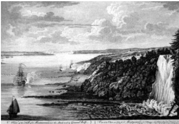
Fig. 1. After the conquest, the Montmorency Falls became the visual metonymy of the Quebec landscape. "A View of the Fall of Montmorenci and the Attack made by General Wolfe, on the French Intrenchments near Beauport, with the Grenadiers of the Army, July 31, 1759 . . . Drawn on the Spot by Capt. Hervey Smyth. Engraved by Wm. Elliot," in Scenographia Americana .

The Scenographia Americana begins with views from Canada: Quebec City, the Montmorency Falls, Cape Rouge, the Gaspé, Rock Percé, the Miramichi Valley, Montreal, and Louisbourg (fig. 1). Then follow four views of cities in long-settled British North America: New York (twice), Boston, and Charleston. Next are four views of dramatic riverine landscapes in New York and New Jersey: the Jersey Palisades, the Catskills as seen from the Hudson, the Great Cohoes Falls on the Mohawk River, and the Passaic River Falls (fig. 2). The next two prints show the Moravian settlement at Bethlehem, Pennsylvania, and an imaginary scene of an American farm (fig. 3). The rest of the series shifts to the Caribbean, with four views of the harbor and city of Havana, two street scenes of Havana, one view of the British attack on Roseau, Dominique, and three scenes around Guadeloupe (one of a battle and two of the British occupation forces).