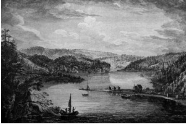
Fig. 4. Despite the triumphalism of its caption, this scene mutes the implicit violence of its middle ground by framing it between a hunting party in the foreground and a sublime valley in the background. "A View of Gaspe Bay, in the Gulf of St. Laurence. This French Settlement used to supply Quebec with Fish; till it was destroyed by General Wolfe after the surrender of Louisburg in 1758 . . . Drawn on the Spot by Capt. Hervey Smyth, Engraved by Peter Mazell," in Scenographia Americana .

The Scenographia Americana corresponded closely with this imperial optimism. Its sublime landscapes of the Middle Colonies linked them with those of the empire's vast accessions in Canada; together they implied a reassuring familiarity with the territories to be governed (fig. 6). The scenes from Havana and Guadeloupe reminded viewers that prosperous peace had succeeded fiscally ruinous war. Though Cuba and Guadeloupe had been returned in the peace settlement, the Free Port Act of 1766 authorized trade with Spanish and French colonies from Jamaica and Dominica respectively. The rising sun in the last print provides a subtly optimistic symbol of these liberalized trades by visually echoing the sun's rays in the stripes of the enormous Union Jacks flying off the transoms of three British ships returning home (fig. 7).