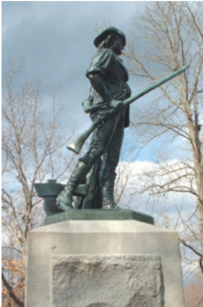
Fig. 2. The Concord Minuteman by Daniel Chester French. This sculpture can be found today at the Old North Bridge in Concord, Massachusetts.

flagitious attempt could only be made under some general pretence by a state legislature. But if in any blind pursuit of inordinate power, either should attempt it, this amendment may be appealed to as a restraint on both." Supreme Court Justice Joseph Story, writing in 1840, agreed that the right of the people to keep and bear arms had "justly been considered, as the palladium of the liberties of a republic." And after the Civil War, the charge Southern whites were depriving blacks of their right to be armed was instrumental in convincing Congress to pass the Fourteenth Amendment.