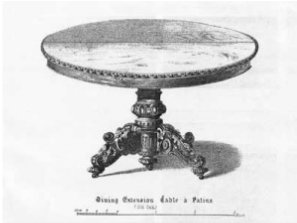
Dining extension table, from The Cabinet Maker's Album of Furniture (Philadelphia, 1868).