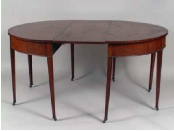
Three-part dining table, 1790-1810. Accession Number 1957.219.

This set, consists of three pieces—two circular tables and a central leaf. When not in use, the leaf extension could be stored, and the tables could be pushed against the wall for use as side tables. Also common were sets of three distinct tables, including a center table with drop leaves and two identical side tables. The center table could be extended by lifting the leaves and could stand alone or be combined with one or both of the side tables. When the family was not entertaining, all three tables could be used for card playing, writing, tea, small meals, and other activities.