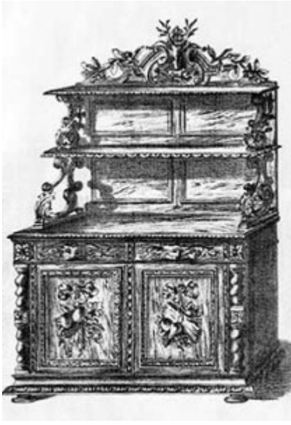
Buffet etagère sideboard, from The Cabinet Maker's Album of Furniture (Philadelphia, 1868).

The development of the sideboard form from the clean, straight lines of the Federal period to the more elaborate and ornate decoration of the Victorian era reflects, of course, a stylistic shift. But it reflects two other factors as well: the increasing importance of the dining ritual in the middle-class home and the need for more storage.