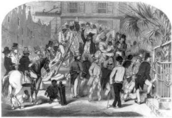
“Slave Sale, Charleston, South Carolina,” from a sketch by Eyre Crowe. Illustration in The Illustrated London News (Nov. 29, 1856).

Orleans cotton market more than once in the 1810s, lent $48,000 to Louisiana-based enslaver Alonzo Walsh. The terms? Walsh had to pay the money back in four years at a rate of about eight percent. To secure payment he committed to consigning his entire crop each year to Nolte to be sold in Liverpool. And, just in case, he provided collateral: “from 90 to a 100 head of first rate slaves will be mortgaged.” In 1824 those nearly five score people meant up to $80,000 on the New Orleans auction block—a form of property whose value fluctuated less than bales of cotton.