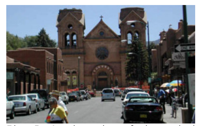
Fig. 5. Another view of the cathedral.