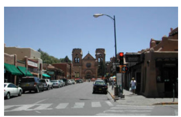
Fig. 4. Looking east down San Francisco Street towards the cathedral. The cathedral stands on the site of the original parish church built there in 1625, and San Francisco Street is one of the streets of the seventeenth-century town of Santa Fe.

Oñate proceeded to break a number of the Laws of the Indies in his efforts to regain the expenses he had spent in order to establish the colony and in his efforts to make the big Gran Quivira gold strike. Establishing a viable colony, getting farming and ranching established, and setting the religious conversion program of the Franciscans on a sound basis were all secondary concerns. Ultimately this led to dissension and factionalism. The colony divided between the militarists, who were convinced that a little more squeezing, a few more expeditions against surrounding tribes, would reveal the great quantities of gold that Coronado had said the Indians of the area had told him about, and the settlers, who wanted to establish their farms and ranches, set up a reasonable working relationship with the pueblos, and get the colony onto a sound economic footing. A trade in hides, cattle, sheep, and salt to the silver mining towns to the south could produce a dependable income.