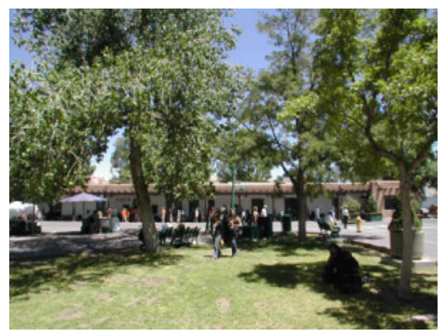
Fig. 3. Looking north across the plaza at the Governor's Palace.

had been right in his claim that Santa Fe had been established sometime soon after 1609, and 1610 became the accepted date for the founding of Santa Fe.