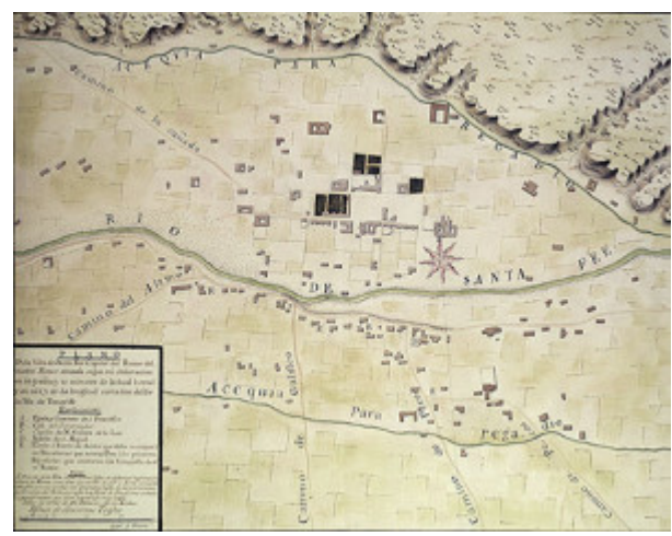
Fig. 1. Plano de la Villa de Sante Fe. The earliest known map of Santa Fe, drawn by Joseph de Urrutia in 1767. The Governor's Palace is marked with the letter B, and the open square south of it is the present town plaza. The original plaza of 1607 was long and rectangular, extending from the front of the Governor's Palace all the way east to the parish church, marked A on the map.

second permanent Spanish colony within the present United States—San Augustine, Florida, founded in 1565, was the first—and was established within a year of the settling of Jamestown, the first permanent east coast English colony, in 1607. It was the first permanent European colony in the American west.