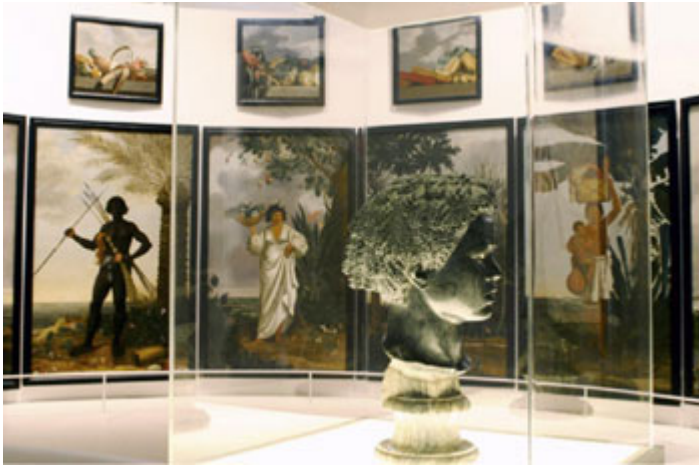
Le musée du quai Branly

Inside every French statesman there's an intellectual fighting—or, more likely, arguing—his way out. Should you have the time and disregard for global warming, buy a plane ticket and fly away to see a new museum in Paris that proves my point. The musée du quai Branly is dedicated to non-Western art. Every outgoing French leader has to have a monumental project and Quai Branly was Jacques Chirac's—the French call it “le musée Chirac.” Yet the first thing you see upon entering the museum is the Theatre Claude Lévi-Strauss, named for the late patriarch of French structuralist anthropology. Imagine a little, theatrical Lévi-Strauss within a big, sprawling Chirac—two big egos managing somehow to coexist. The egos are, here, in the humble service of the people whom Lévi-Strauss claimed had a “savage mind,” one neither simpler nor lesser than the mind of civilized people, just different.