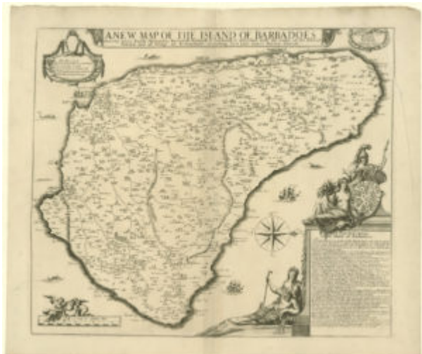
Fig. 1. A New Map of the Island of Barbadoes , after a survey by Richard Forde,