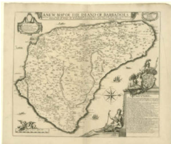
Fig. 1. A New Map of the Island of Barbadoes, after a survey by Richard Forde,