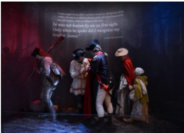
2. "He Was Not Known to me on First Sight." The finished tableau representing the meeting of Charles and James Peale on the banks of the Delaware, December 8, 1776.

He now met his brother James, who had a commission in the Maryland line, and had been in the rear guard, through all the retreat of the American Army, from the north River, and had lost all of his cloaths. He was in an Old dirty Blanket Jacket, his beard long, and his face so full of Sores, that he could not clean it, which disfigured him in such a manner that he was not known by his brother at first sight.