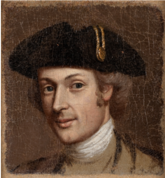
1. Charles Willson Peale, Self-Portrait , 1777-78, oil on canvas, 13X12.5 inches.

Published papers are an invaluable resource for historians and the public alike. But it is sometimes useful and often necessary for historians to return to the archives to consult the original documents because editors can exclude material, and archivists, researchers, and the original owners can jumble the order of things. I was reminded of this necessity three years ago when, as a consulting historian, I accepted a project to help research a new exhibit on the Ten Crucial Days Campaign of the winter of 1776-1777 for the Museum of the American Revolution, which opened in Philadelphia in April 2017. One element of my project seemed easy enough: discuss the civilian lives of a company of Philadelphia militia who participated in the Ten Crucial Days Campaign. We needed to know who they were, where they lived, what they did for work, and why they became revolutionaries. These questions complicated what I originally thought was a simple task.