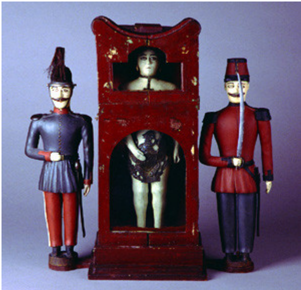
Fig. 2a. Gentleman's Amusement (closed position), early nineteenth century. Wood, glass, and metal, 18 x 14 1/4 x 5 3/4 inches.