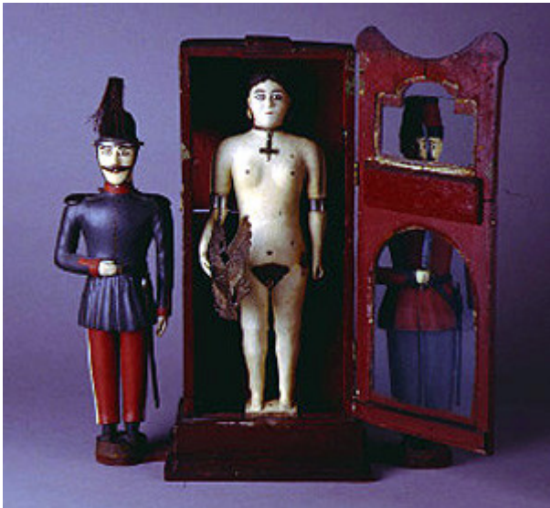
Fig. 2b. Gentleman's Amusement (open position), early nineteenth century. Wood, glass, and metal, 18 x 14 1/4 x 5 3/4 inches.

The next erotic object I discovered at Winterthur is a work of "homegrown" folk art: a kind of interactive peepshow now known by its modern title Gentlemen's Amusement . Produced by an unknown craftsman in the first half of the nineteenth century, this extraordinary assemblage consists of a small rectangular cabinet containing the carved wooden figure of a Native American woman who holds the U.S. coat of arms. Two wooden soldiers in full military regalia flank the cabinet as if standing guard (fig. 2a). When Gentlemen's Amusement is in the closed position, the woman's face and the national crest are visible through windows in the cabinet door. When the door is opened and a hidden lever is shifted, the crest gets pulled aside exposing the fully naked body of the native female (fig. 2b). This pornographic toy was probably used by an all-male audience in a tavern, fraternal club, or some other place where men