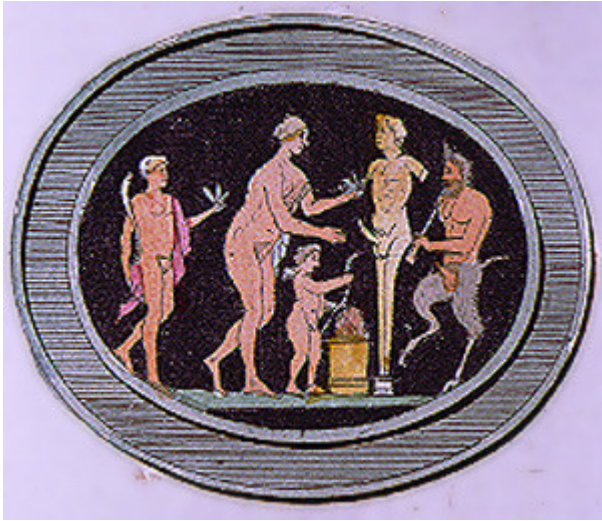
Fig. 1a. Fig. 1a. Hand-colored engraving from [Pierre-François-Hugues d'Hancarville], Veneres Uti Observantur in Gemmis Antiquis (s.n., 1771?), page 137, plate 27.