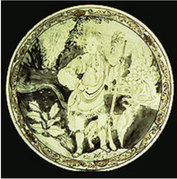
Fig. 3a. Saucer (top side), ca. 1730. Porcelain, 7/8 x 4 5/8 x 4 5/8 inches. Gift of Mr. Charles K. Davis.