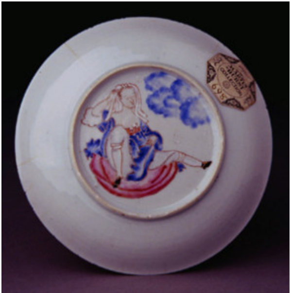
Fig. 3b. Saucer (bottom side), ca. 1730. Porcelain, 7/8 x 4 5/8 x 4 5/8 inches. Courtesy, Winterthur Museum, Gift of Mr. Charles K. Davis.

Despite my best efforts to be a thorough researcher, I did not find this saucer using any of the normal searching methods. In fact, I probably walked by it dozens of times in the museum where it hung with the top-side, hunter image facing out in a china cabinet, never suspecting it had a dirty underbelly. Nor did my virtual wanderings through Winterthur's collections database lead me to identify the saucer as relevant to my project. Instead, I happened upon a reproduction of it in a book about porcelain while researching an unrelated topic. My failure to discover this object using the collections catalog underscores one of the chief problems in researching erotica: namely, the absence of a standardized classification system. In my database queries for pornographic imagery, I tried specific, sex-related terms including pornography, erotic, obscene, sex, and breast; as well as more generic