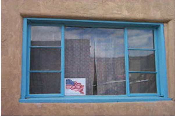
U.S. flag in a home window, Acoma.