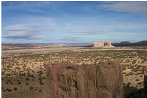
View from the top of the mesa, Acoma.

In late December 2001, my husband Mark, kids Lily, Max, and Sam, and I were at the end of a tour of Acoma Pueblo, America's oldest continually inhabited village. About sixty miles west of Albuquerque, New Mexico, Acoma is a nearly thousand-year-old pueblo sitting atop a 367-foot-high mesa, famous for its sixteenth-century run-in with Spanish governor Juan de Oñate, its massive, seventeenth-century adobe mission church, and its contemporary potters. Eating sizzling hot frybread sprinkled with cinnamon and sugar, we huddled together amidst the dwellings in the sharp winter sun, gazing out at Mount Taylor and some of the most dramatic landscape in the American West.