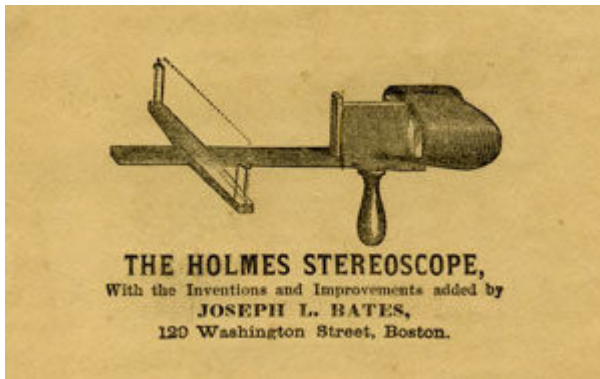
Fig. 4. Holmes-Bates Stereoscope (ca. 1860).

Other photographic entrepreneurs recognized the potential of stereographs as popular entertainment. The Boston team of Southworth & Hawes designed the grand parlor or gallery stereoscope (fig. 3) “a complete Picture Gallery in itself” with its three-dimensional views—“A view of the street seems the street itself”—that could be seen in their Tremont Street studios in 1853. But this expensive apparatus was not designed for ordinary homes. By 1858, when Edward Anthony first entered into the stereo “craze” with a box of a dozen views of the Fulton Street Prayer meetings, other Broadway merchants such as the publishers D. Appleton Company had already recognized the potential market as shown in the view of their Stereoscopic Emporium with its crowded shelves and displays of Stereoscopic Views everywhere. An article in the American Journal of Photography that same year highlighted some of the major attractions of the boom, reporting “stereoscopes are at last coming into vogue with us ... this maybe somewhat owing to price since they can be bought for $1.50 a dozen.” They went on to say that it would be strange “if many parlors were without them,” for what would better suit a guest waiting for the lady of the house to appear, or “What better interlude during an evening party than to fill up a pause with a glance at a fine stereoscopic view?”