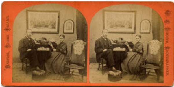
Fig. 10. “Stereo of Couple in the Parlor,” photograph by W. P. Liscomb, Bristol, Rhode Island. Courtesy of the American Antiquarian Society, Worcester, Massachusetts.

and amusement. As an 1860 advertisement for the American and Foreign Stereoscopic Emporium that appeared in many newspapers put it: The stereoscope was the “most Instructive, interesting, entertaining, amusing and exciting of modern inventions.” No home would be complete without it, “and it must and will penetrate everywhere ,” and, to extend the theme of cultural advancement, to “EVERY GENTLEMEN OF WEALTH AND REFINEMENT.” The means of creating a proper parlor became available to all those willing and able to purchase the necessary mass consumer goods. See, for example, the Lipscomb Stereo (fig. 10) of a couple playing chess in their parlor with their prints, doilies draped over the rocking chair, and the woman holding a book in one hand, with the stereo viewer on the table behind, all attesting to their mastery of the tools of refined living. Objects were culture in tangible form, historian Katherine Grier writes, and the parlor, with its formulaic vocabulary of furniture, carpets, decorative lighting objects, center tables, pianos, and stereoviews, was the “theater of culture” in the Victorian age. Anthony’s Broadway on a Rainy Day , as I had come to realize, was no mere illustration but helped to create that new culture.