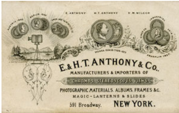
Fig. 8. "Trade card of E. & H.T. Anthony & Co.," 8 x 12 cm, New York (between 1870 and 1900?).

New York was the subject of many Anthony stereographs and was also the center of Anthony's national system of production and distribution. The firm contracted with a network of brokers to secure photographs for their inventory of American Scenes and distributed their views over the new rail system across the continent. Broadway on a Rainy Day was part of a series of 175 instantaneous views that included other views of the New York Harbor and other street scenes such as the series on the visit of the Japanese Embassy to New York in June of 1860 ( http://digitalgallery.nypl.org/nypldigital/id?G91F182_030F ). By 1873, their trade list included over 11,000 items. Hales insightfully argues that Anthony's stereographs take an innovative approach to the representation of the city as process, while also utilizing conservative characteristics in their visual depiction and business practices to maximize their adoption in the American home.