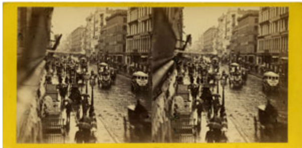
Fig. 1. "Broadway on a Rainy Day," front view, stereographic photograph,

As I eagerly sorted through what seemed to be an inexhaustible supply of boxes of stereographs at the American Antiquarian Society (AAS), I came to a stop at the view of Broadway on a Rainy Day from about 1859. Stereographs were an early form of three-dimensional photography that used a pair of two-dimensional images, side by side, to be viewed in a special stereo viewer (fig. 1). The rectangular orange card with its dual images featured a long perspective along glistening streets and crowded sidewalks, filled with umbrella-covered pedestrians and horse-drawn vehicles, all caught in mid-motion, except for a small carriage in the immediate foreground. This view of Broadway and New York itself was a very different image of the city than its photographic predecessors that had either offered blurred figures or streets devoid of activity, in order to make up for their long exposures. With little text on the front other than copyright, I turned over the card and read: Anthony's Instantaneous Views, Broadway on a Rainy Day , no. 5095, Published by E. & H. T. Anthony & Co., American and Foreign Stereoscopic Emporium, 501 Broadway New York (fig. 2).