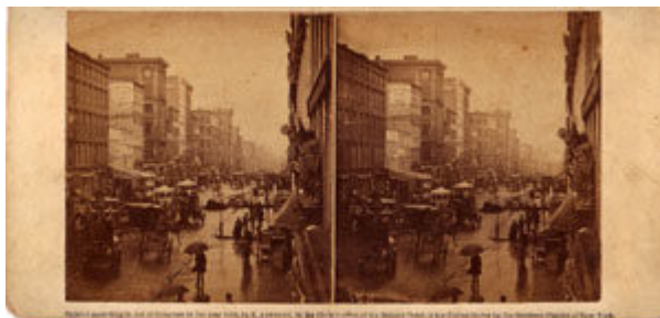
Fig. 9. "Broadway on a Rainy Day [looking north]," E. & H. T. Anthony, Anthony's Instantaneous Views No. 188 (1859), author's collection.