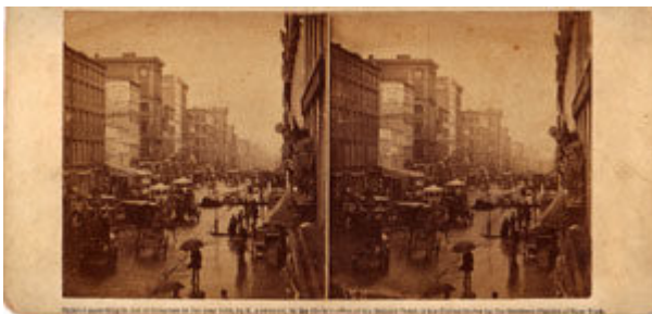
Fig. 9. "Broadway on a Rainy Day [looking north]," E. & H. T. Anthony, Anthony's Instantaneous Views No. 188 (1859)