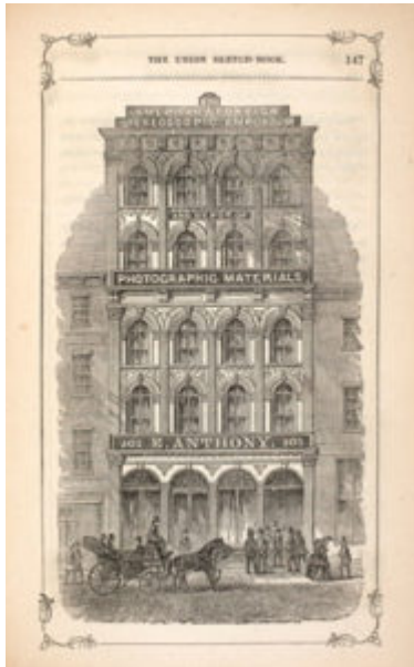
Fig. 5. "Advertisement for E. Anthony, American & Foreign Stereoscopic Emporium," on p. 147 in The Union Sketch-book: A reliable guide, exhibiting the history and business resources of the leading mercantile and manufacturing firms of New York... , by Gobreight and Pratt, New York (1860).