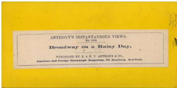
Fig. 2. "Broadway on a Rainy Day," back view, stereographic photograph, Anthony's Instantaneous Views No. 5095, E. & H.T. Anthony & Co., New York (ca. 1859).

I was starting a new project, "New York as Cultural Capital," a study of how New York City and several of its key manufacturing trades were critical to the cultural development of a new Victorian domestic culture, materialized in parlor suites of furniture, displays of stereographs and chromolithographs, and plaster figures. Middle-class Americans eagerly sought these household objects that signified culture and refinement by their associations with artistic taste and worldly knowledge. First, I decided to tackle AAS's stereograph collection, more specifically, the stereos of E. & H. T. Anthony & Co., one of the largest American producers. The firm was located on several sites on Broadway, from which they sent forth thousands of images of domestic and foreign scenes. Cultural production and direction increasingly came from urban places in the nineteenth century, and New York was at the center of that reorientation of American culture. That new metropolitan culture became the national culture through the efforts of an important group of cultural entrepreneurs that included Edward Anthony, Currier & Ives, John Rogers, and the Harper Brothers—the subjects of my project.