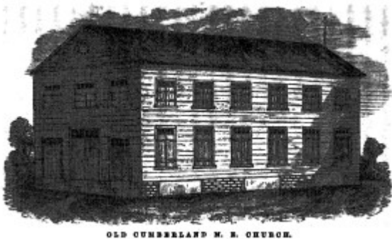
OLD CUMBERLAND M. E. CHURCH.

Nineteenth-century commentators disturbed by the mistreatment understood it as a response to the large number of Charleston black Methodists as well as to the enthusiastic worship practices of those churches. This understanding was correct but inadequate on two counts. First, it never took a true measure of the significance of the number of Charleston black Methodists. They constituted the greatest number and the densest concentration of black Protestants in the world around 1820. No other center of black Protestantism—for example, Boston, New York, Philadelphia, St. John's (Antigua), Kingston (Jamaica)—came even close to Charleston for numbers of black worshipers. Second, it gave black worshipers little credit for enthusiasm, conversions, and revivals among whites as well as among blacks. Yet the commentary of white contemporaries suggested that African Americans were at the forefront of enthusiasm. We gain a better comprehension not only of this history of violence but also of Charleston black Methodists' self-understanding if we gauge the significance of their numbers and if we understand them as principal actors in the Methodist Episcopal Church and, later, in an independent congregation.